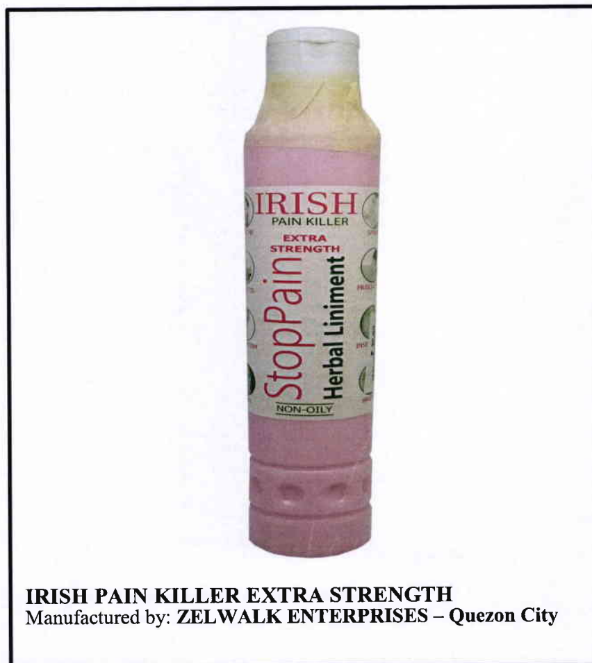
Figure 1. Unregistered drug product

The Food and Drug Administration (FDA) advises the public against the purchase and use of the following unregistered drug products: