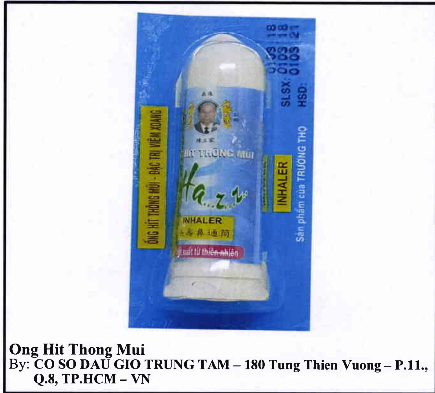
Figure 3. Unregistered drug product