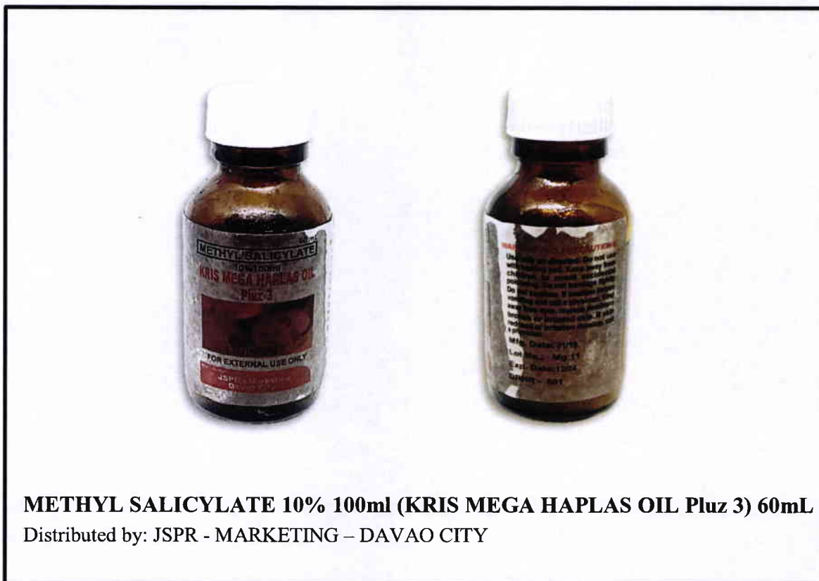
Figure 4. Unregistered drug product

FDA Post-Marketing Surveillance (PMS) activities have verified that the abovementioned drug products have not gone through the registration and testing process of the Agency and have not been issued with proper authorization in the form of Certificate of Product Registration. Thus, the Agency cannot guarantee their quality and safety. Therefore consumption of such violative products may pose potential danger or injury to health.