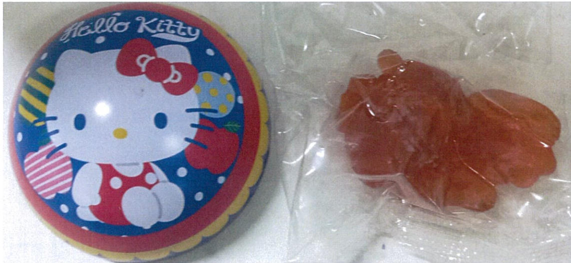
Figure 1. Unregistered MOMOKO Strawberry Flavoured Gummy (in Hello Kitty Ball), 20g

The Food and Drug Administration (FDA) warns the public from purchasing and consuming the following unregistered food products: