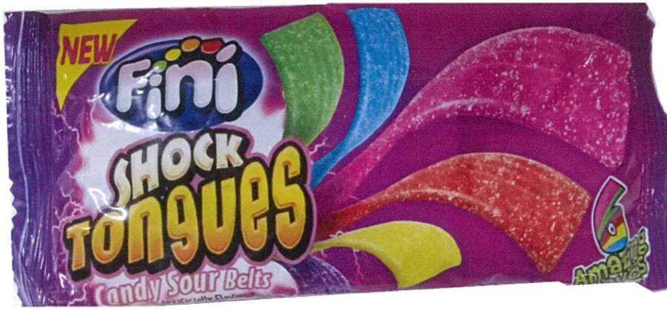
Figure 2. Unregistered New FINI Shock Tongues Candy Sour Belts, 70g