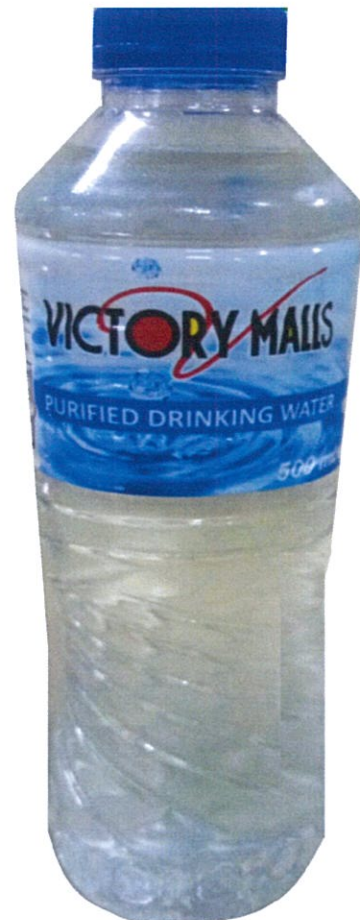
Figure 4. Unregistered VICTORY MALLS Purified Drinking Water