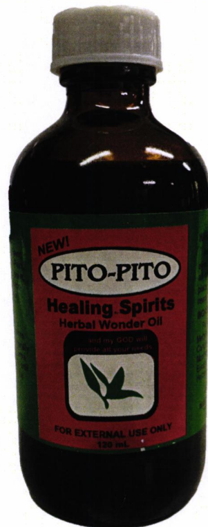
NEW! PITO-PITO Healing Spirits Herbal Wonder Oil 120mL Repacked by: Double Eagle Marketing - Manila, Philippines