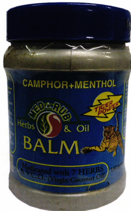
CAMPBOR+MENTHOL MED RUB Herbs & Oil BALM Medicated with 7 HERBS & V.C.O. (Virgin Coconut Oil) 150 gms (Blue container) Distributed by: JRR INT'L. LABORATORIES