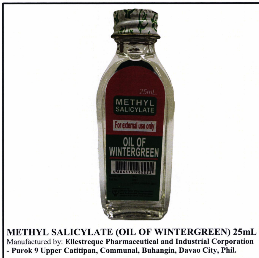
Larawan 1. Hindi rehistradong gamot

Pinapayuhan ng Food and Drug Administration (FDA) ang publiko laban sa pagbili at paggamit ng mga hindi rehistradong gamot na: