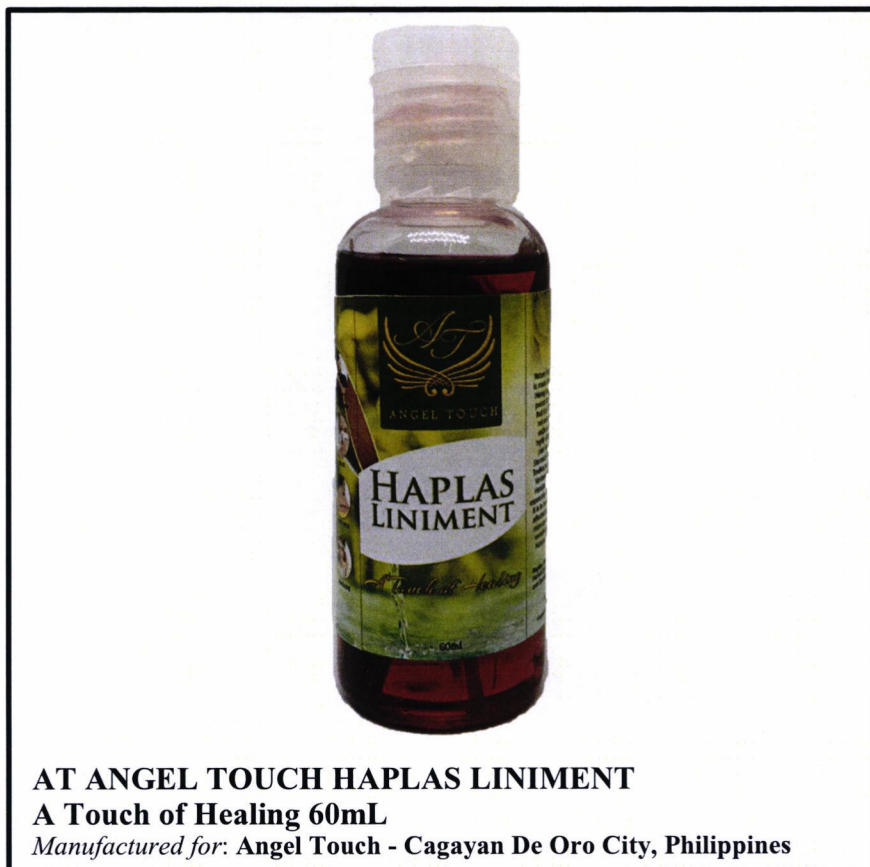
Larawan 1. Hindi rehistradong gamot

Pinapayuhan ng Food and Drug Administration (FDA) ang publiko laban sa pagbili at paggamit ng mga hindi rehistradong gamot na: