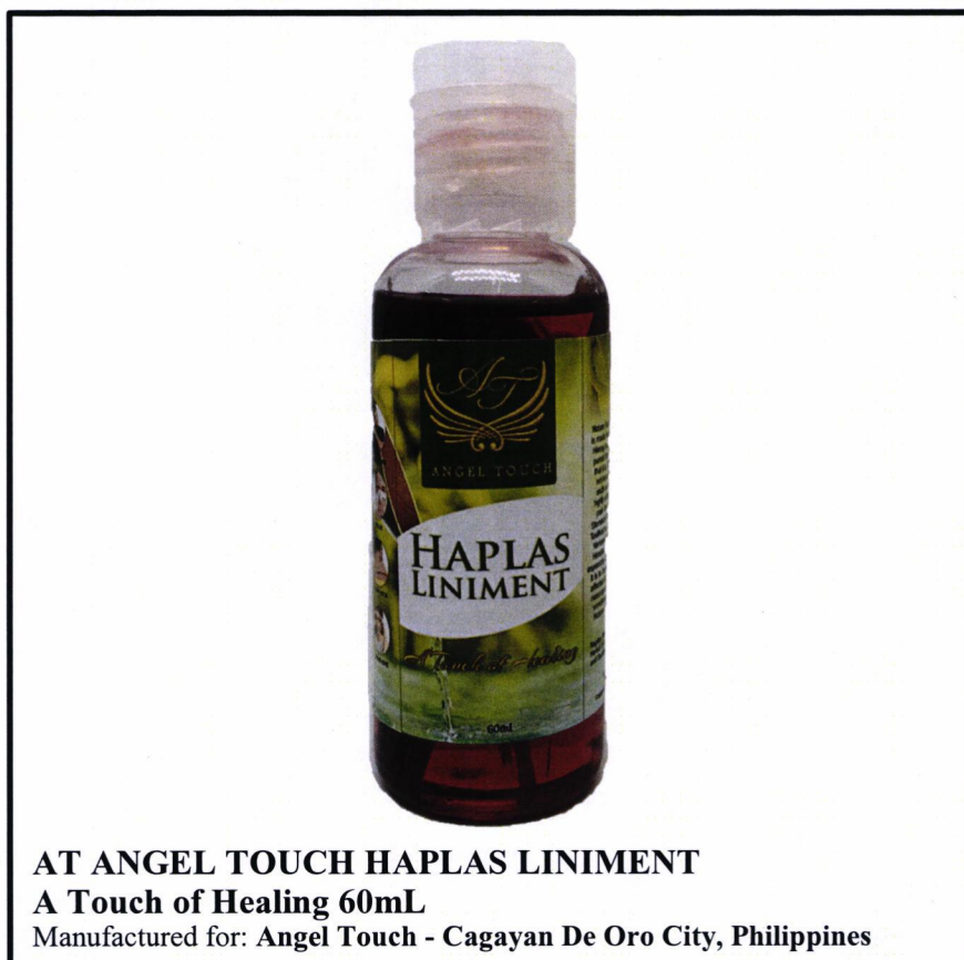
Figure 1. Unregistered drug product

The Food and Drug Administration (FDA) advises the public against the purchase and use of the following unregistered drug products: