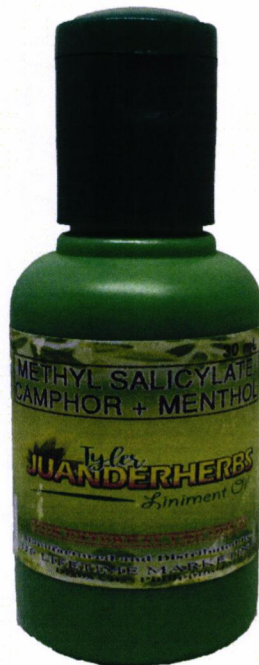
Figure 2. Unregistered drug product

Manufactured and Exclusively Distributed by: J.S CASTILLO HEALTH AND BEAUTY PRODUCTS