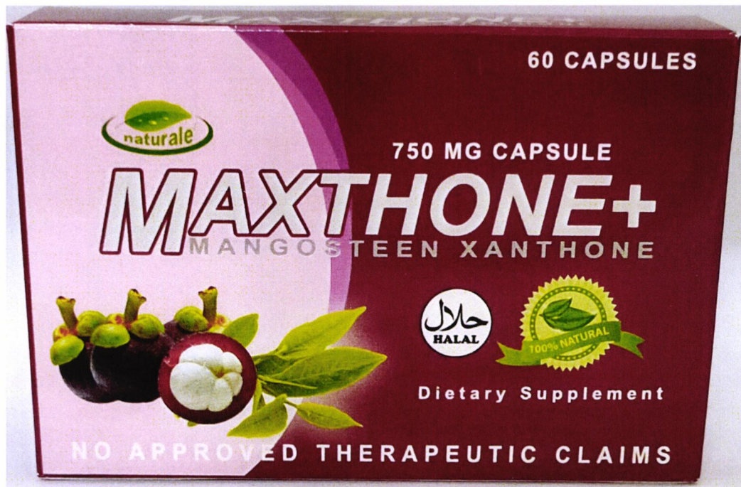
Figure 2. Unregistered MAXTHONE+ Mangosteen Xanthone Dietary Supplement Capsule