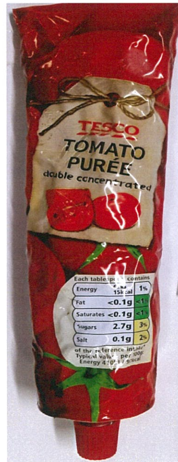
Figure 3. Unregistered TESCO Tomato Puree Double Concentrated, 200g