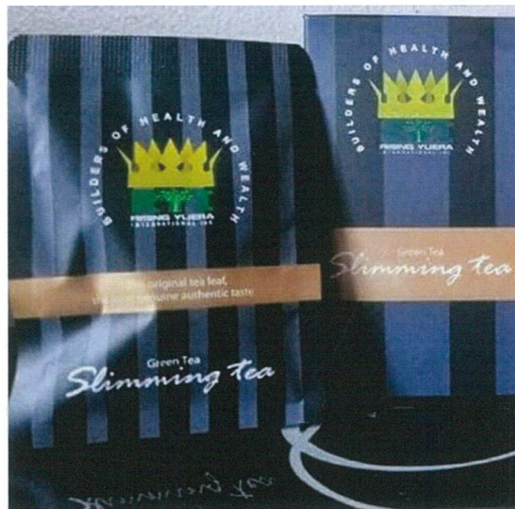
Figure 1. Unregistered Green Tea Slimming Tea

The Food and Drug Administration (FDA) warns the public from purchasing and consuming the following unregistered food products: