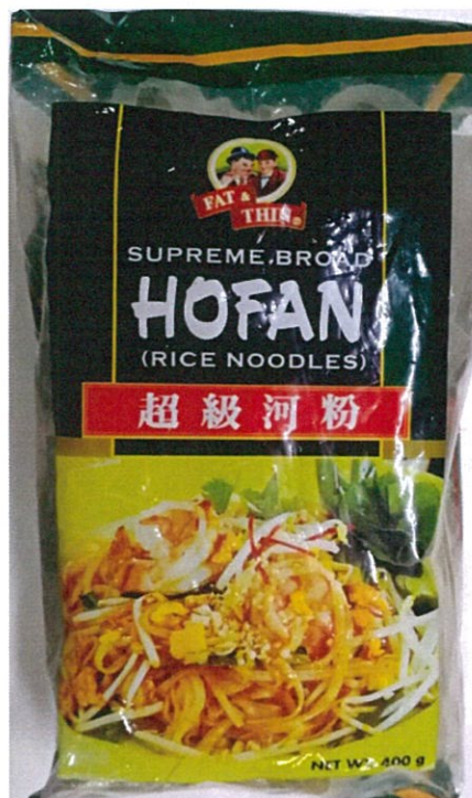
Figure 4. Unregistered FAT & THIN Supreme Broad Hofan Rice Noodles, 400g