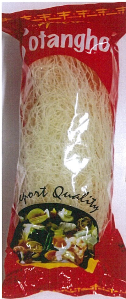
Figure 2. Unregistered TIFFANY Special Sotanghon, 200g