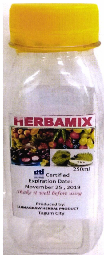
Figure 2. Unregistered HERBAMIX