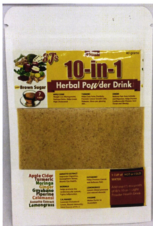
Figure 1. Unregistered 8J'S Light 10-in-1 Herbal Powder Drink

The Food and Drug Administration (FDA) warns the public from purchasing and consuming the following unregistered food products: