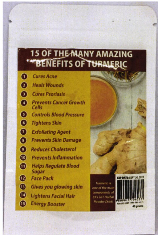
Figure 2. Unregistered 8J'S 3-in-1 Herbal Powder Drink