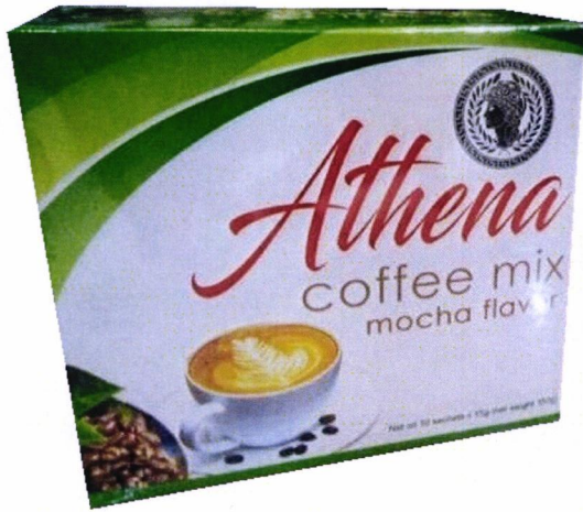
Figure 2. Unregistered ATHENA Coffee Mix Mocha Flavor