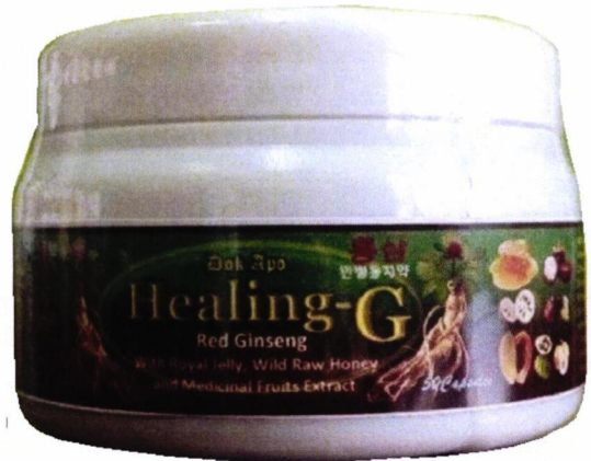
Figure 4. Unregistered DOK APO HEALING-G Red Ginseng with Royal Jelly, Wild Raw Honey and Medicinal Fruit Extract