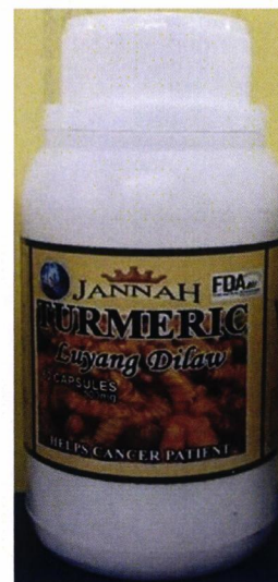
Figure 5. Unregistered JANNAH Mangosteen Herbal Dietary Supplement Capsule