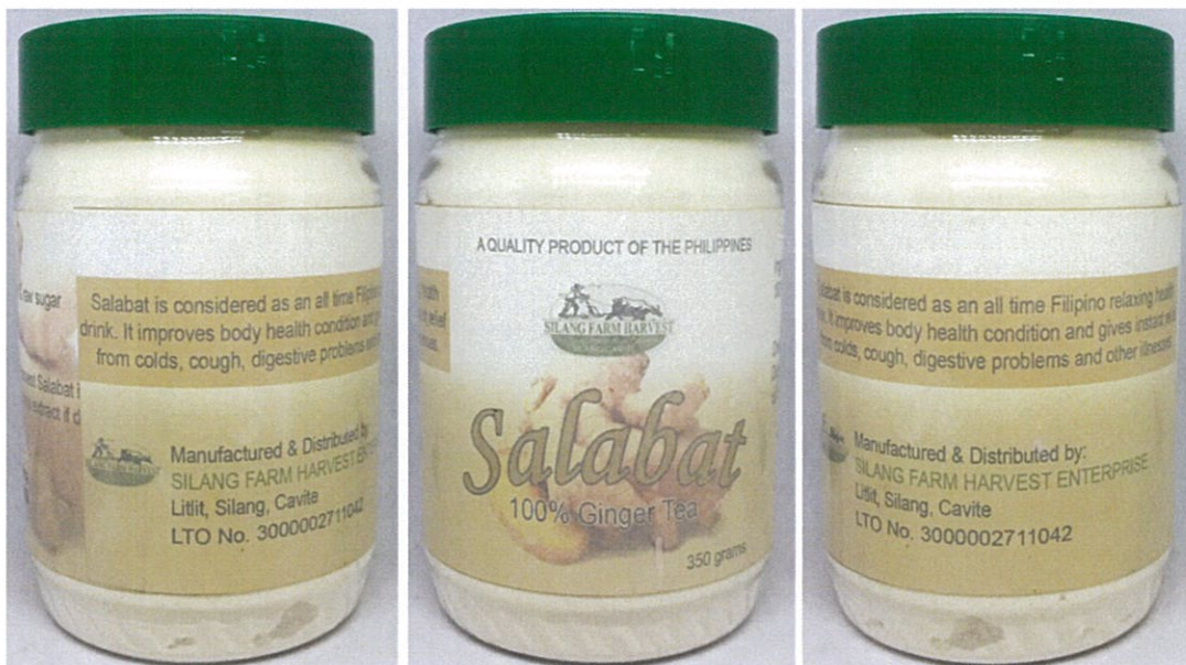
Figure 3. Unregistered SILANG FARM HARVEST Salabat 100% Ginger Tea