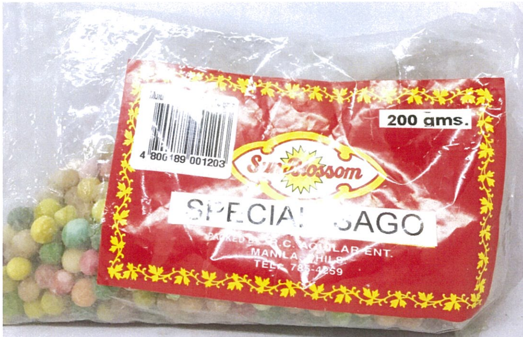
Figure 4. Unregistered SUN BLOSSOM Special Sago