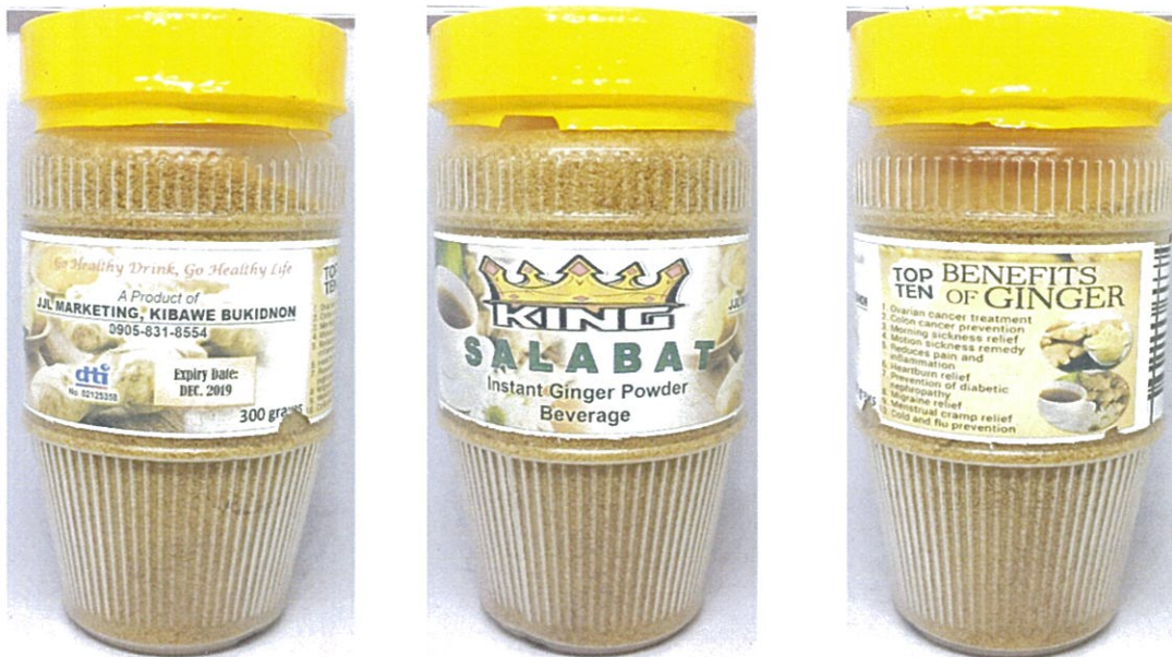
Figure 1. Unregistered KING Salabat Instant Ginger Powder Beverage

The Food and Drug Administration (FDA) warns the public from purchasing and consuming the following unregistered food products: