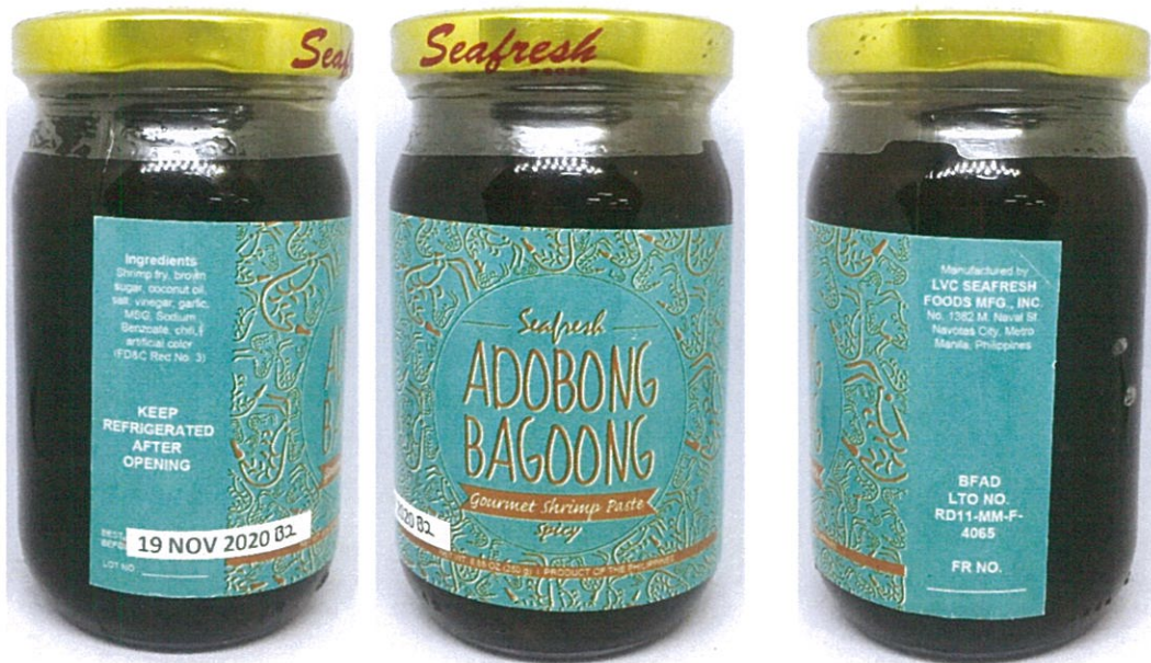
Figure 2. Unregistered SEAFRESH Adobong Bagoong Gourmet Shrimp Paste Spicy