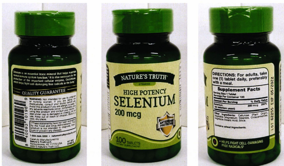
Figure 3. Unregistered NATURE'S TRUTH VITAMINS High Potency Selenium 200mcg Dietary Supplement