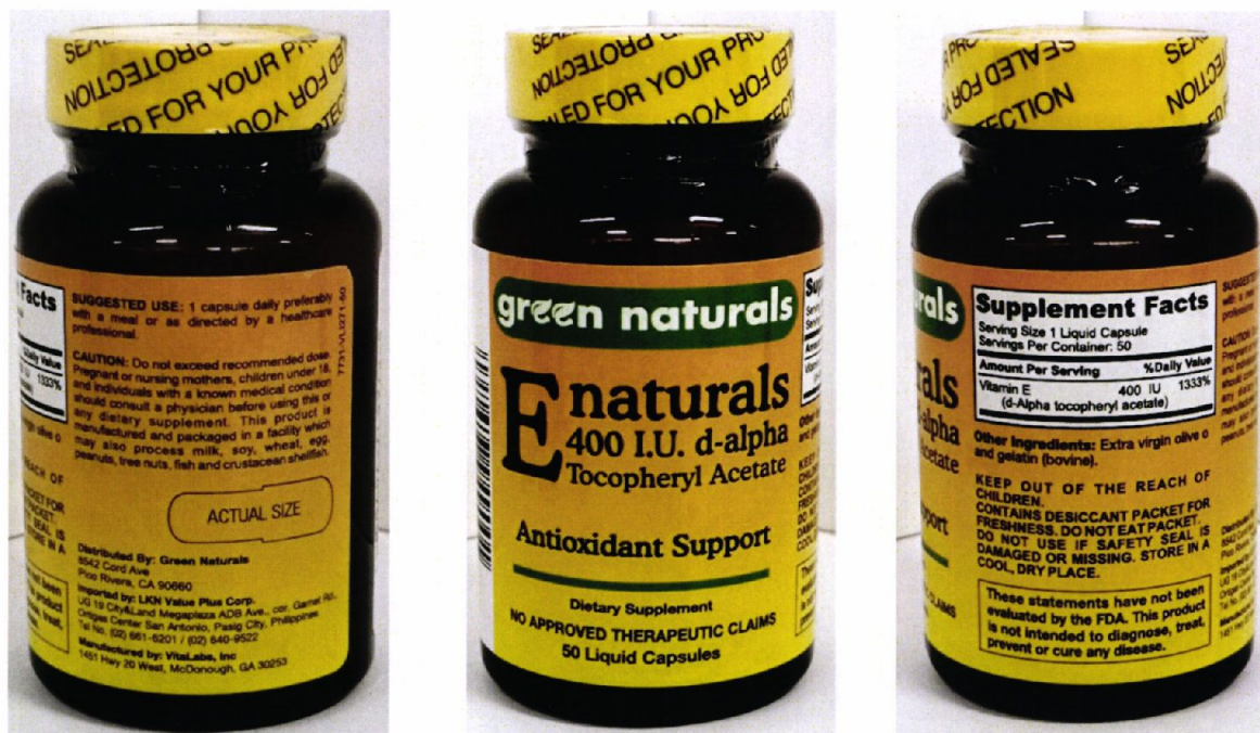
Figure 1. Unregistered GREEN NATURALS ENaturals 400 I.U d-alpha Tocopheryl Acetate Anti-oxidant Support Dietary Supplement

The Food and Drug Administration (FDA) advises the public from purchasing and consuming the following unregistered food supplements: