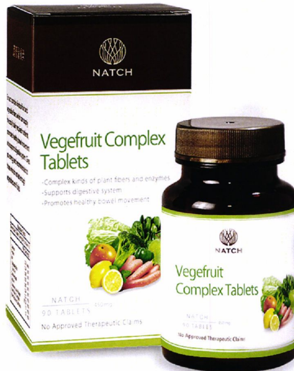
Figure 3. Unregistered NATCH Vegefruit Complex Tablets