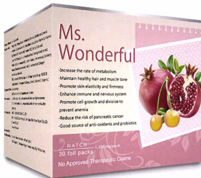
Figure 1. Unregistered MS. WONDERFUL Food Supplement

The Food and Drug Administration (FDA) warns the public from purchasing and consuming the following unregistered food supplements: