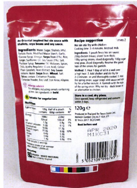
Figure 2. Unregistered TESCO Hoisin Stir Fry Sauce