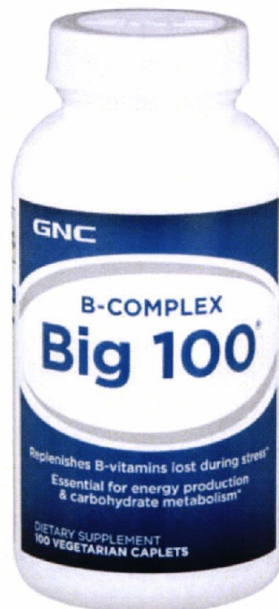
Figure 1. Unregistered GNC BIG 100 B-Complex Dietary Supplement Vegetarian Caplets

The Food and Drug Administration (FDA) warns the public from purchasing and consuming the following unregistered food supplement and food products: