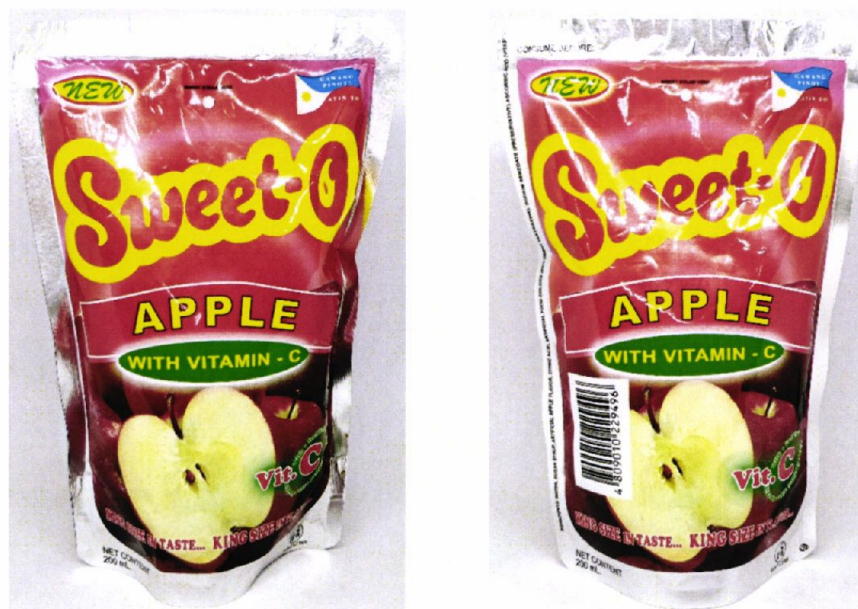
Figure 5. Unregistered SWEET-O Apple with Vitamin C

The FDA verified through post-marketing surveillance that the abovementioned food supplement and food products are not authorized and the Certificates of Product Registration have not been issued. Pursuant to the Republic Act No. 9711, otherwise known as the “Food and Drug Administration Act of 2009”, the manufacture, importation, exportation, sale, offering for sale, distribution, transfer, non-consumer use, promotion, advertising or sponsorship of health products without the proper authorization is prohibited.