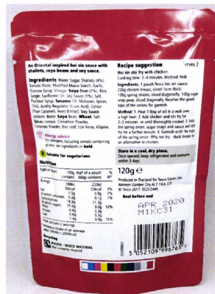
Figure 2. Unregistered TESCO Hoisin Stir Fry Sauce