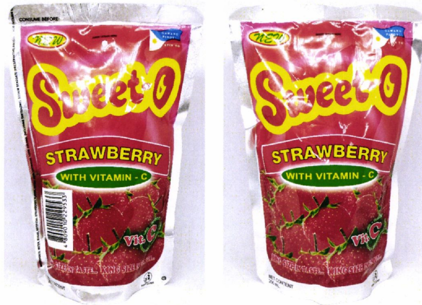
Figure 4. Unregistered SWEET-O Strawberry with Vitamin C