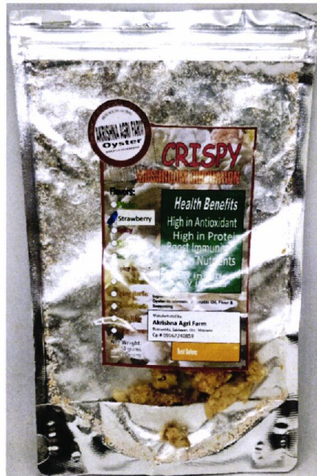
Figure 4. Unregistered AKRISHNA AGRI FARM OYSTER MUSHROOM Crispy Mushroom Chicharon Strawberry Flavor