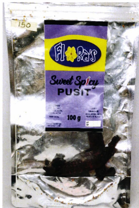
Figure 5. Unregistered FLORA'S Sweet Spicy Pusit

The FDA verified through post-marketing surveillance that the abovementioned food products are not authorized and the Certificates of Product Registration have not been issued. Pursuant to the Republic Act No. 9711, otherwise known as the “Food and Drug Administration Act of 2009”, the manufacture, importation, exportation, sale, offering for sale, distribution, transfer, non-consumer use, promotion, advertising or sponsorship of health products without the proper authorization is prohibited.