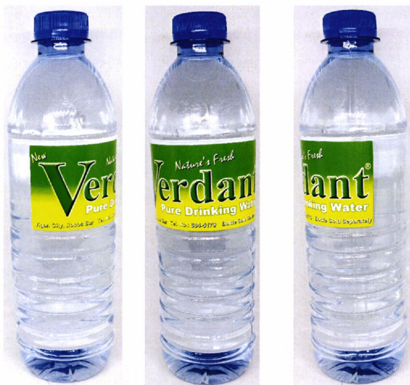
Figure 3. Unregistered NATURE'S FRESH VERDANT Pure Drinking Water