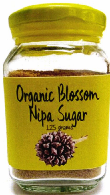
Figure 1. Unregistered MAMA'S Organic Blossom Nipa Sugar

The Food and Drug Administration (FDA) warns the public from purchasing and consuming the following unregistered food products: