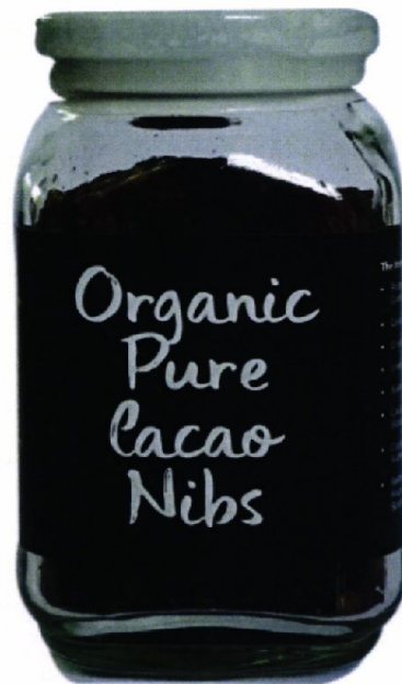
Figure 3. Unregistered MAMA'S Organic Pure Cacao Nibs