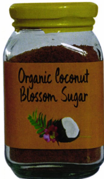
Figure 5. Unregistered MAMA'S Organic Coconut Blossom Sugar

The FDA verified through post-marketing surveillance that the abovementioned food products are not authorized and the Certificates of Product Registration have not been issued. Pursuant to the Republic Act No. 9711, otherwise known as the "Food and Drug Administration Act of 2009", the manufacture, importation, exportation, sale, offering for sale, distribution, transfer, non-consumer use, promotion, advertising or sponsorship of health products without the proper authorization is prohibited.