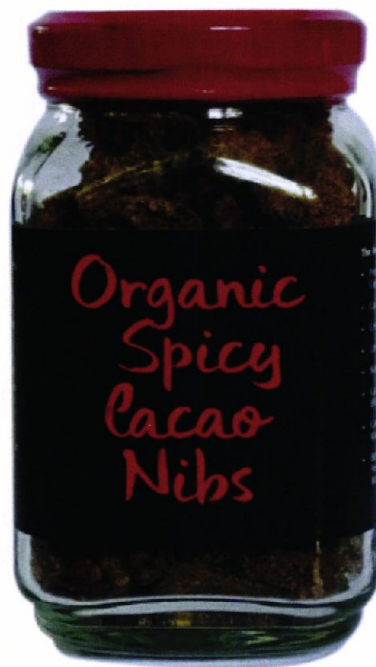
Figure 2. Unregistered MAMA'S Organic Spicy Cacao Nibs