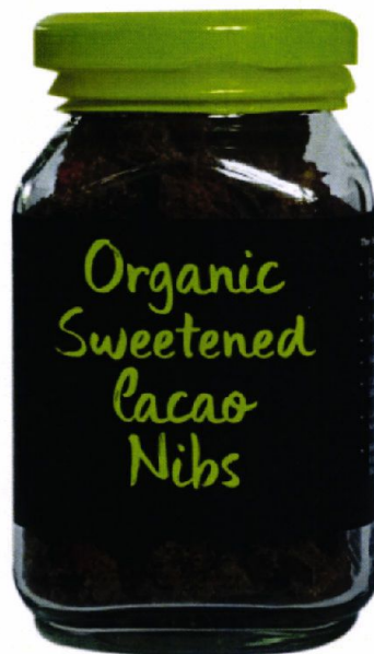
Figure 1. Unregistered MAMA'S Organic Sweetened Cacao Nibs

The Food and Drug Administration (FDA) warns the public from purchasing and consuming the following unregistered food products: