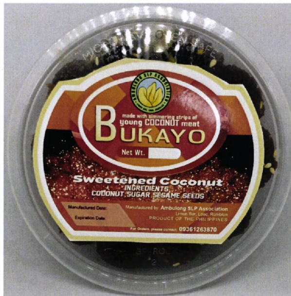
Figure 1. Unregistered AMBULONG SLP ASSOCIATION Bukayo Sweetened Coconut

The Food and Drug Administration (FDA) warns the public from purchasing and consuming the following unregistered food products: