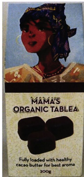
Figure 5. Unregistered MAMA'S Organic Tablea Praline

The FDA verified through post-marketing surveillance that the abovementioned food products are not authorized and the Certificates of Product Registration have not been issued. Pursuant to the Republic Act No. 9711, otherwise known as the "Food and Drug Administration Act of 2009", the manufacture, importation, exportation, sale, offering for sale, distribution, transfer, non-consumer use, promotion, advertising or sponsorship of health products without the proper authorization is prohibited.