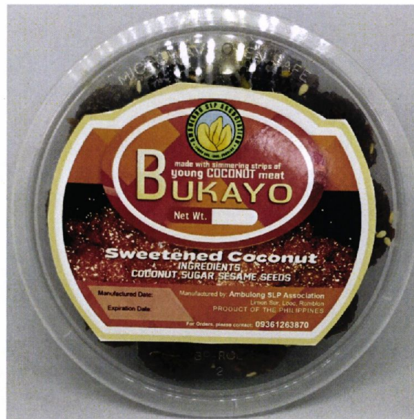
Figure 1. Unregistered AMBULONG SLP ASSOCIATION Bukayo Sweetened Coconut

The Food and Drug Administration (FDA) warns the public from purchasing and consuming the following unregistered food products: