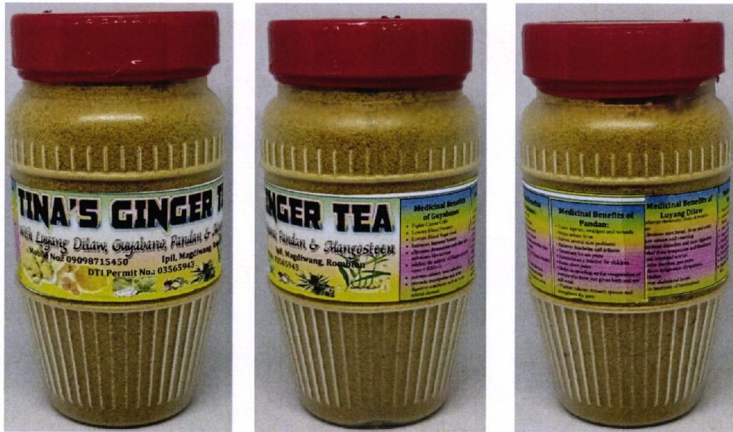
Figure 2. Unregistered TINA'S Ginger Tea with Luyang Dilaw, Guyabano, Pandan & Mangosteen