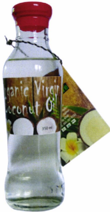
Figure 4. Unregistered MAMA'S Organic Virgin Coconut Oil