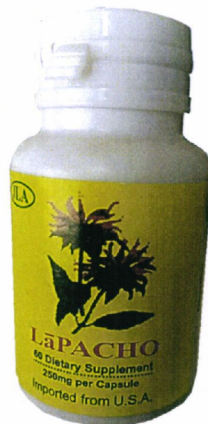
Figure 3. Unregistered JLA Lapacho Dietary Supplement Capsule