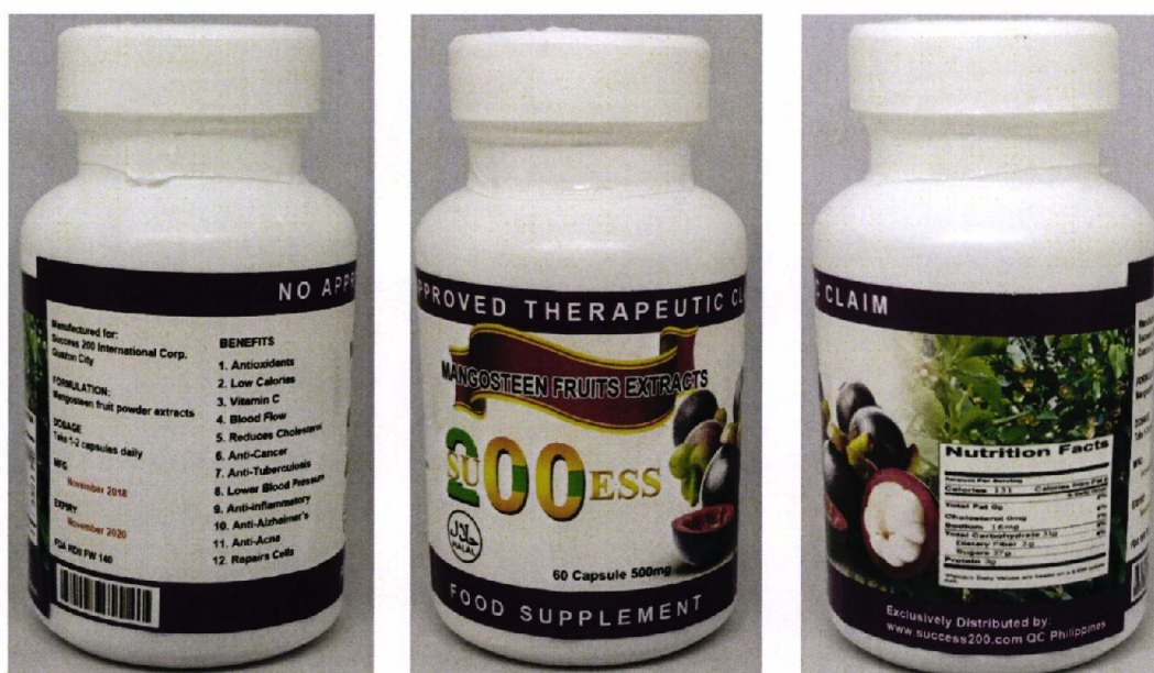
Figure 5. Unregistered 200 SUCCESS Mangosteen Fruit Extracts Food Supplement Capsules

The FDA verified through post-marketing surveillance that the abovementioned food product and food supplements are not authorized and the Certificates of Product Registration have not been issued. Pursuant to the Republic Act No. 9711, otherwise known as the “Food and Drug Administration Act of 2009”, the manufacture, importation, exportation, sale, offering for sale, distribution, transfer, non-consumer use, promotion, advertising or sponsorship of health products without the proper authorization is prohibited.