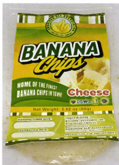
Figure 1. Unregistered AMBULONG SLP ASSOCIATION Banana Chips Cheese, 80g

The Food and Drug Administration (FDA) warns the public from purchasing and consuming the following unregistered food product and food supplements: