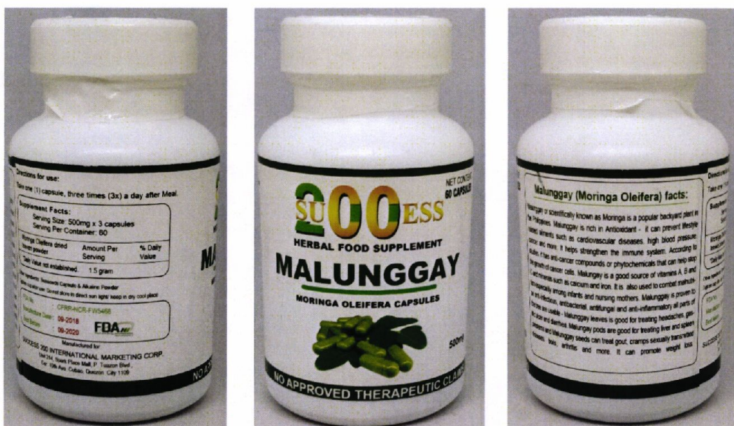
Figure 4. Unregistered 200 SUCCESS Malunggay Moringa oleifera Herbal Food Supplement Capsules