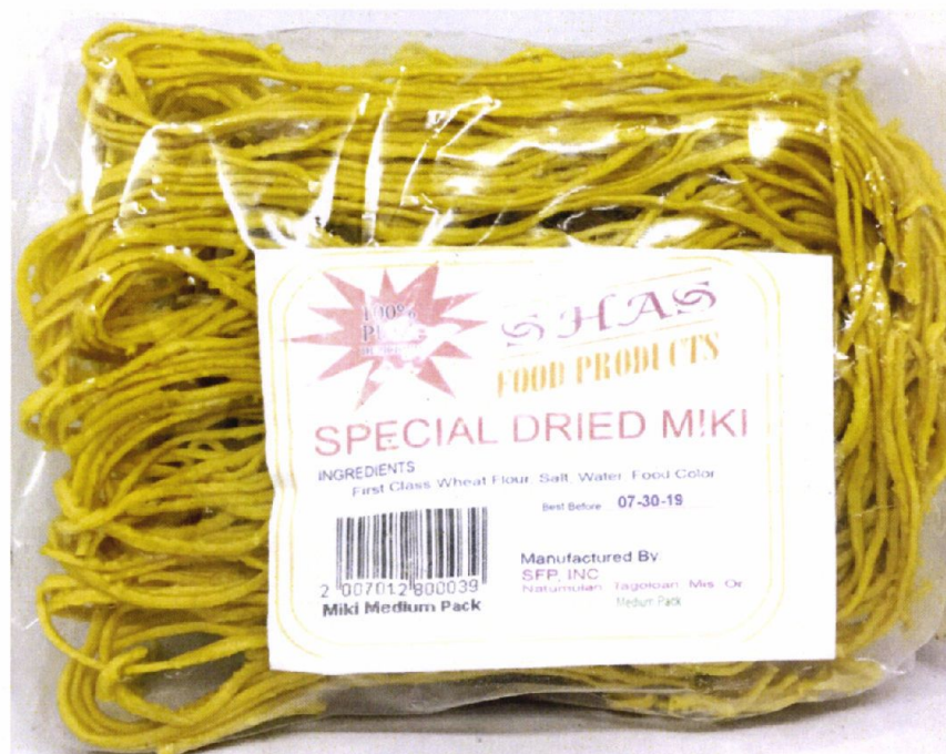
Figure 1. Unregistered SHAS FOOD PRODUCTS Special Dried Miki

The Food and Drug Administration (FDA) warns the public from purchasing and consuming the following unregistered food products: