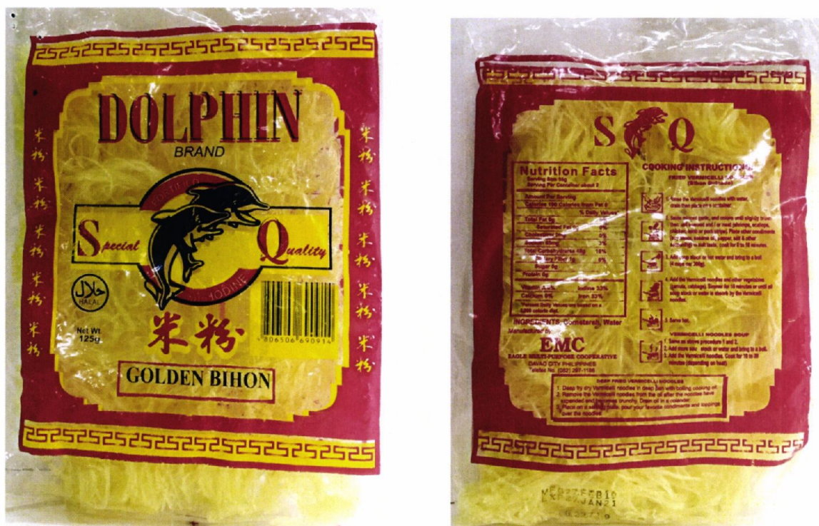
Figure 4. Unregistered DOLPHIN BRAND Special Quality Golden Bihon Fortified with Iodine