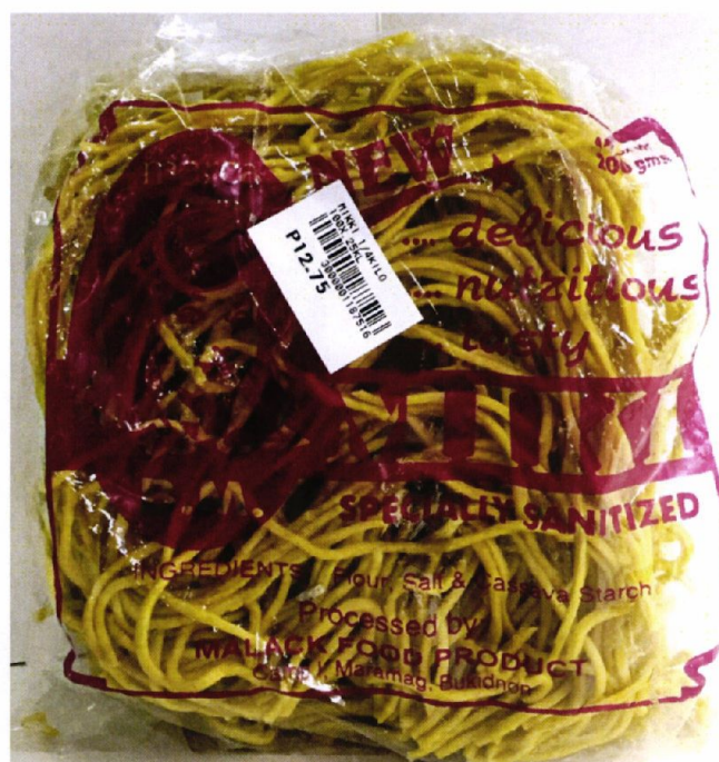
Figure 5. Unregistered MARCA B.M. Miki

The FDA verified through post-marketing surveillance that the abovementioned food products are not authorized and the Certificates of Product Registration have not been issued. Pursuant to the Republic Act No. 9711, otherwise known as the “Food and Drug Administration Act of 2009”, the manufacture, importation, exportation, sale, offering for sale, distribution, transfer, non-consumer use, promotion, advertising or sponsorship of health products without the proper authorization is prohibited.