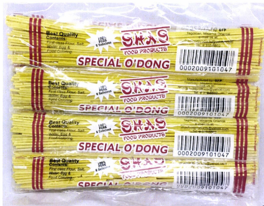
Figure 3. Unregistered SHAS FOOD PRODUCTS Special O'dong