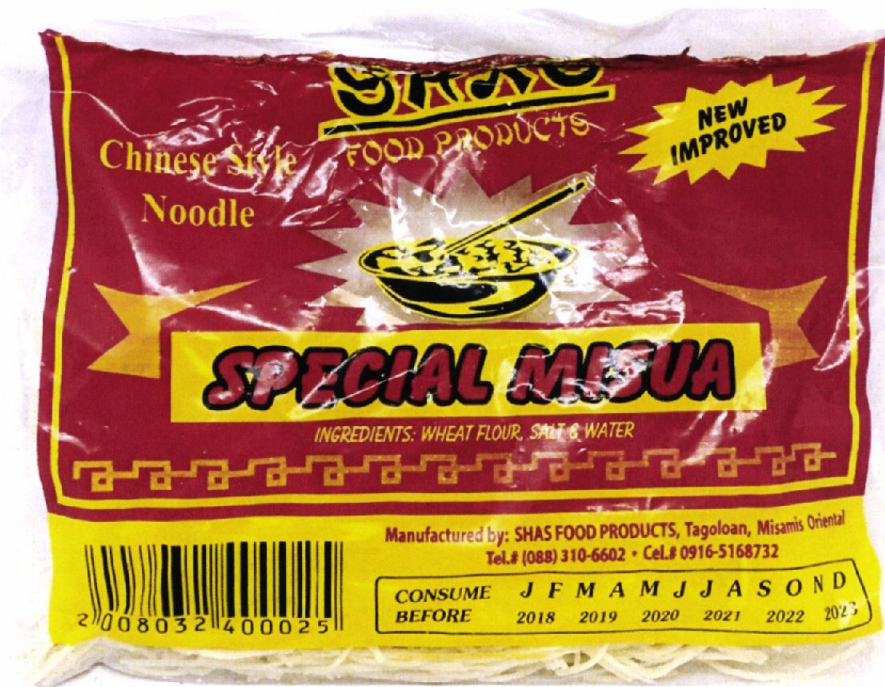
Figure 2. Unregistered SHAS FOOD PRODUCTS Special Misua