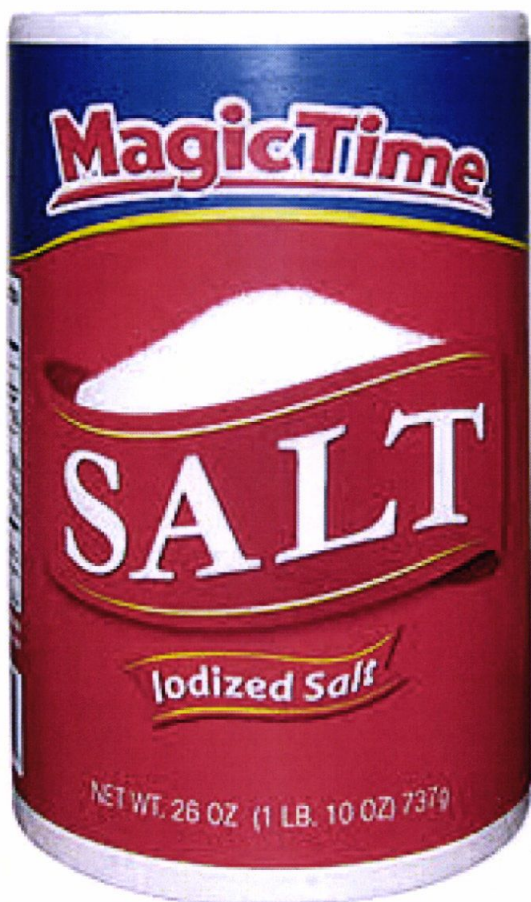
Figure 2. Unregistered MAGIC TIME Salt, Iodized Salt, 737g