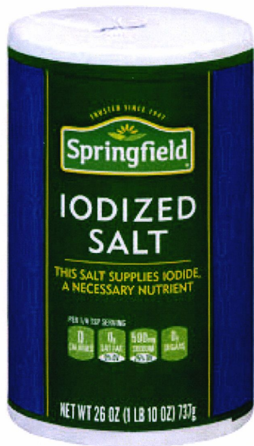
Figure 3. Unregistered SPRINGFIELD Iodized Salt, 737g