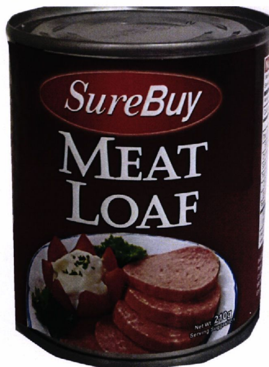
Figure 4. Unregistered SUREBUY Meat Loaf