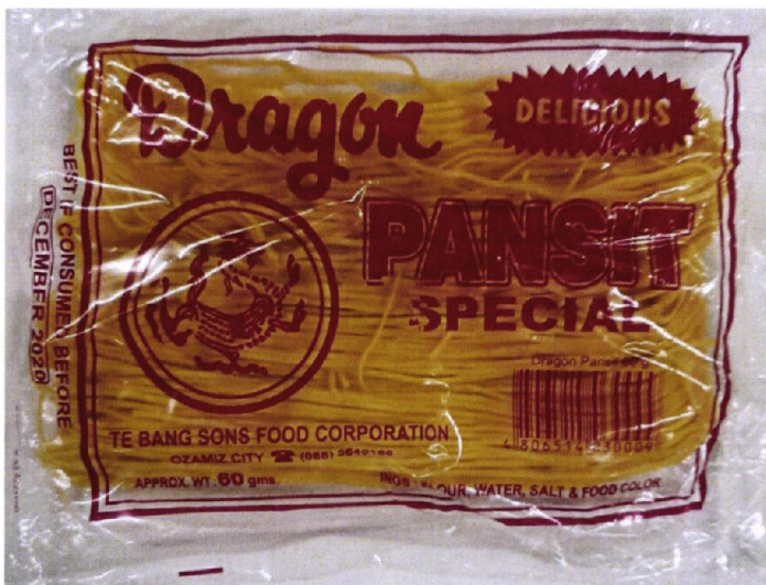
Figure 4. Unregistered DRAGON Pansit Special