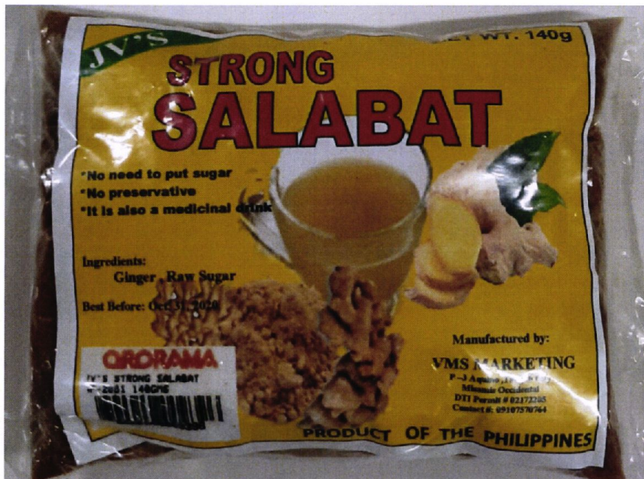
Figure 1. Unregistered JV's Strong Salabat

The Food and Drug Administration (FDA) warns the public from purchasing and consuming the following unregistered food products: