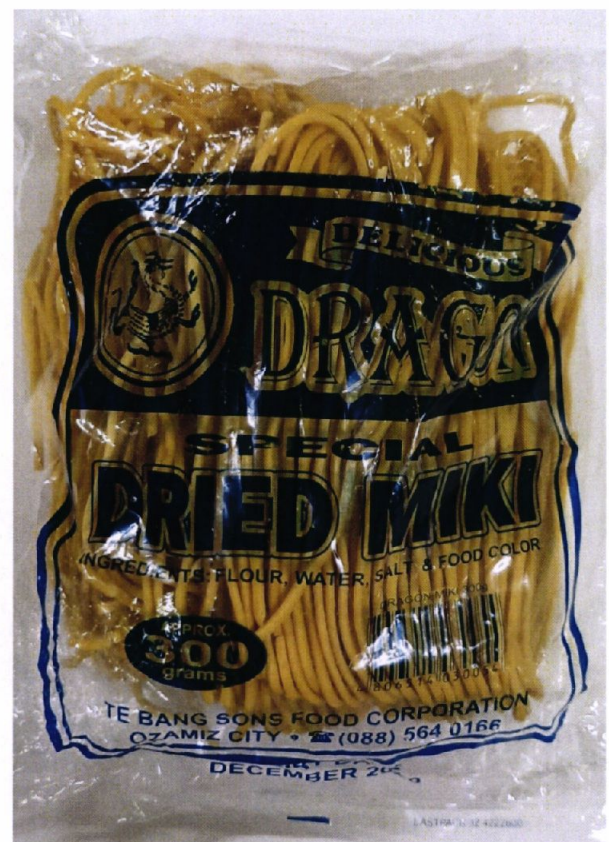
Figure 5. Unregistered DRAGON Special Dried Miki