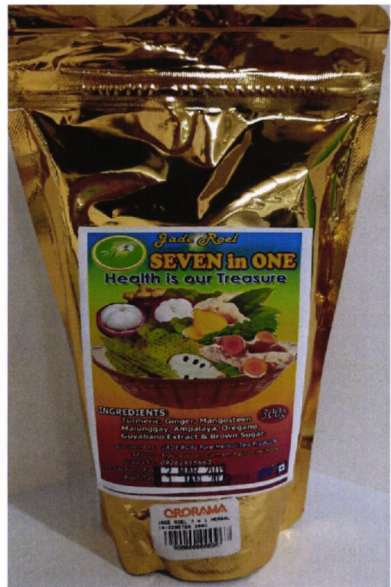
Figure 3. Unregistered JADE ROEL Seven in One (Powder)