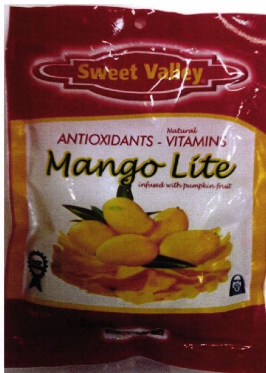
Figure 3. Unregistered SWEET VALLEY Mango Lite Infused with Pumpkin Fruit