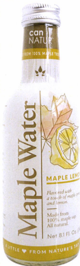
Figure 1. Unregistered CAN NATUR Maple Water Maple Lemon

The Food and Drug Administration (FDA) warns the public from purchasing and consuming the following unregistered food products: