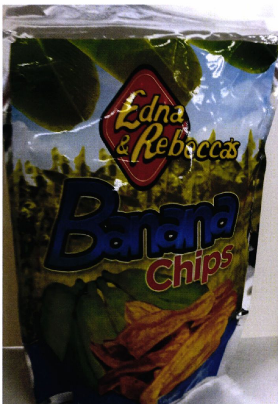
Figure 2. Unregistered EDNA & REBECCA Banana Chips