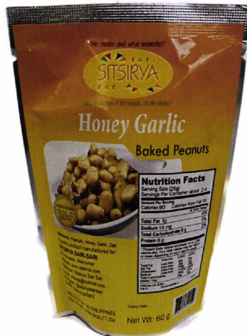
Figure 3. Unregistered SARI SARI SITSIRYA Honey Cinnamon Baked Peanuts