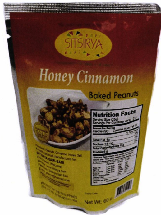
Figure 2. Unregistered SARI SARI SITSIRYA Honey Garlic Baked Nuts