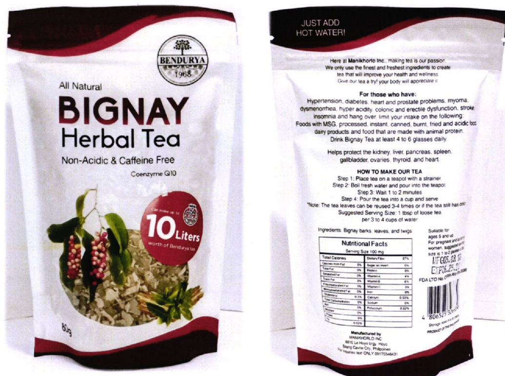
Figure 4. Unregistered BENDURYA All Natural Bignay Herbal Tea