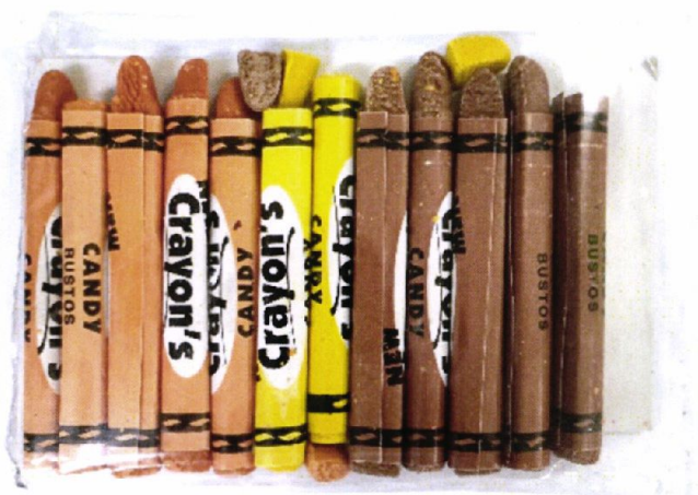
Figure 5. Unregistered DJAY FOOD PRODUCT Bustos Crayon's Candy

The FDA verified through post-marketing surveillance that the abovementioned food products are not authorized and the Certificates of Product Registration have not been issued. Pursuant to the Republic Act No. 9711, otherwise known as the “Food and Drug Administration Act of 2009”, the manufacture, importation, exportation, sale, offering for sale, distribution, transfer,