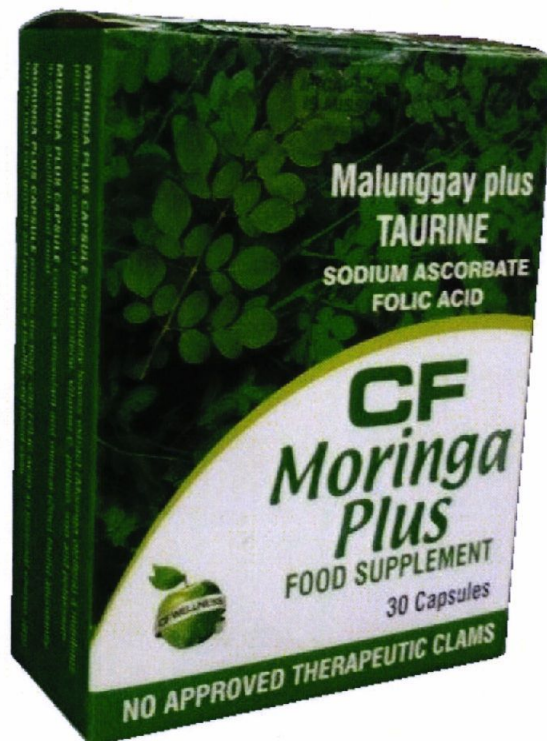
Figure 3. Unregistered CF WELLNESS CF MORINGA PLUS Food Supplement