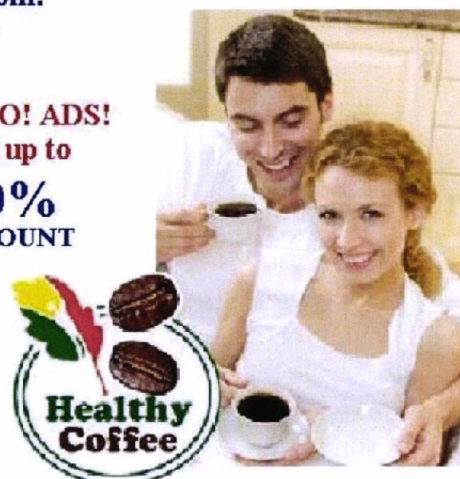
Figure 4. Unregistered ESSENSA NATURALE Masters Coffee 8 in 1