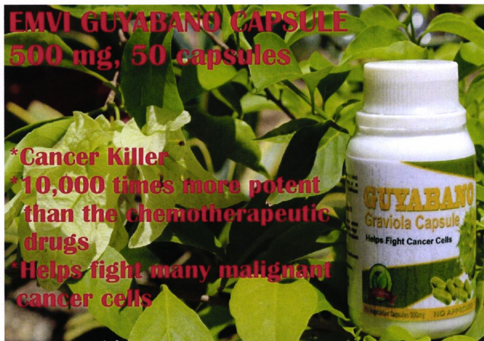
Figure 1. Unregistered EMVI HERBAL PRODUCTS Guyabano Graviola Capsules

The Food and Drug Administration (FDA) warns the public from purchasing and consuming the following unregistered food supplements and food products: