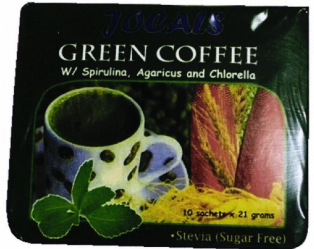
Figure 5. Unregistered JOCALS Green Coffee

The FDA verified through post-marketing surveillance that the abovementioned food supplements and food products are not authorized and the Certificates of Product Registration have not been issued. Pursuant to the Republic Act No. 9711, otherwise known as the "Food and Drug Administration Act of 2009", the manufacture, importation, exportation, sale, offering for sale, distribution, transfer, non-consumer use, promotion, advertising or sponsorship of health products without the proper authorization is prohibited.