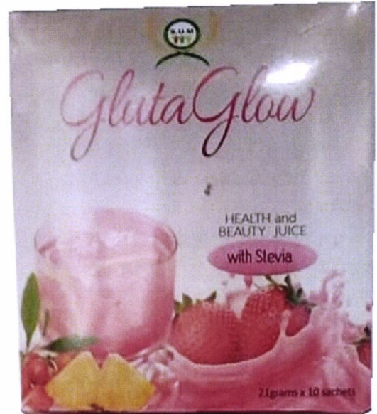
Figure 4. Unregistered JOCALS GLUTA GLOW Powdered Drink Mix