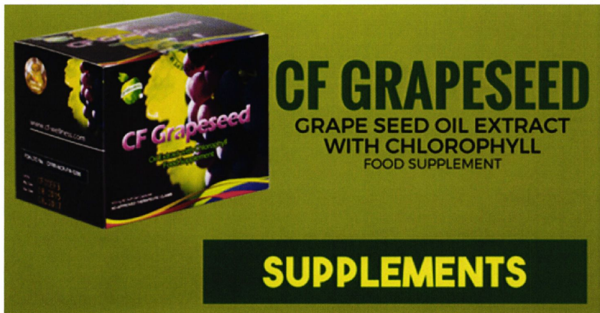
Figure 1. Unregistered CF WELLNESS CF Grapeseed Food Supplement

The Food and Drug Administration (FDA) warns the public from purchasing and consuming the following unregistered food supplements and food products: