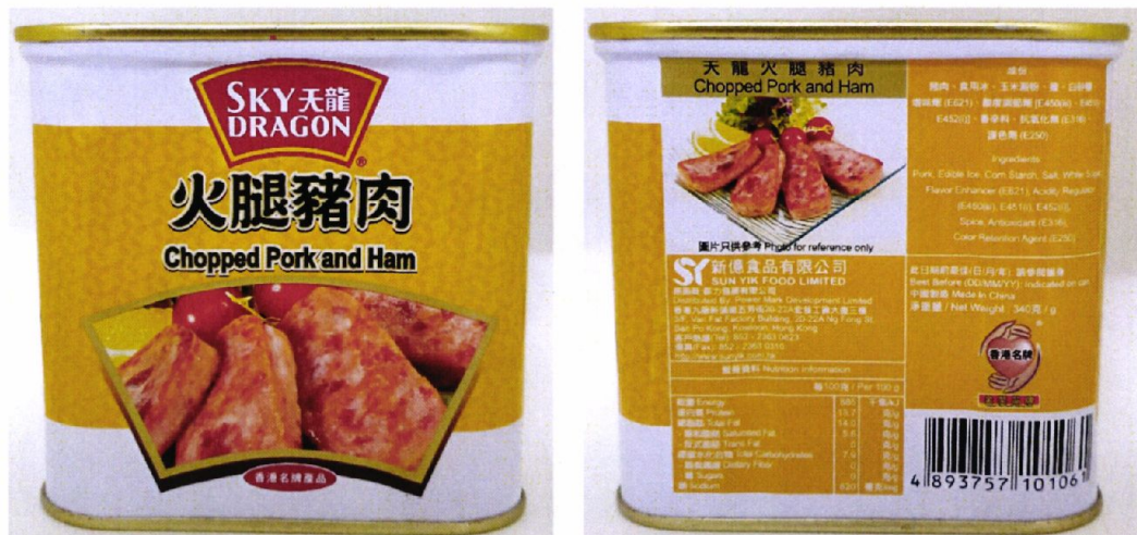
Figure 5. Unregistered SKY DRAGON Chopped Pork and Ham

The FDA verified through post-marketing surveillance that the abovementioned food supplements and food products are not authorized and the Certificates of Product Registration have not been issued. Pursuant to the Republic Act No. 9711, otherwise known as the “Food and Drug Administration Act of 2009”, the manufacture, importation, exportation, sale, offering for sale, distribution, transfer, non-consumer use, promotion, advertising or sponsorship of health products without the proper authorization is prohibited.