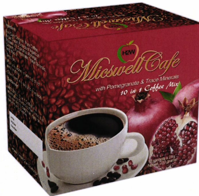
Figure 2. Unregistered H2W MICSWELL CAFÉ 10 in 1 Coffee Mix with Pomegranate & Trace Minerals