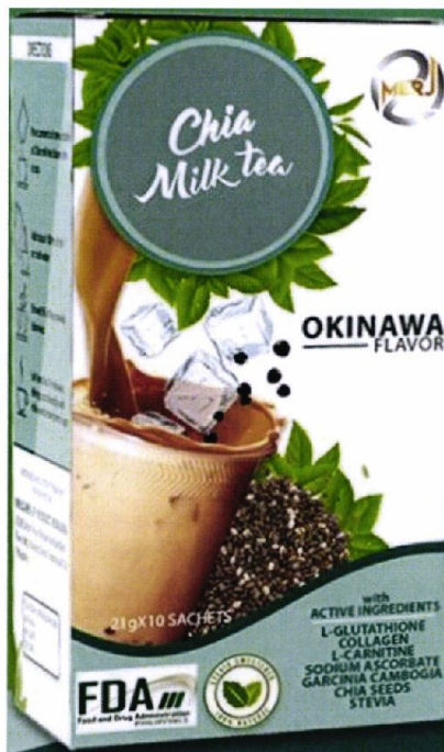
Figure 5. Unregistered MERJ Chia Milk Tea Okinawa Flavor

The FDA verified through post-marketing surveillance that the abovementioned food supplements and food products are not authorized and the Certificates of Product Registration have not been issued. Pursuant to the Republic Act No. 9711, otherwise known as the “Food and Drug Administration Act of 2009”, the manufacture, importation, exportation, sale, offering for sale, distribution, transfer, non-consumer use, promotion, advertising or sponsorship of health products without the proper authorization is prohibited.