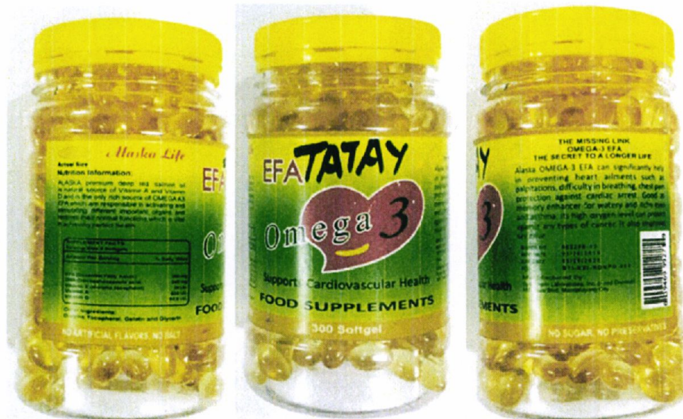
Figure 1. Unregistered ALASKA LIFE EFA Omega 3 Food Supplement Softgels

The Food and Drug Administration (FDA) warns the public from purchasing and consuming the following unregistered food supplements and food products: