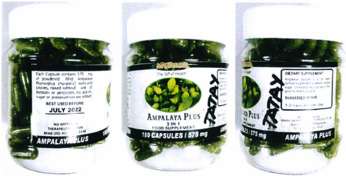
Figure 2. Unregistered MAHARLIKA Ampalaya Plus 3 in 1 Food Supplement Capsule