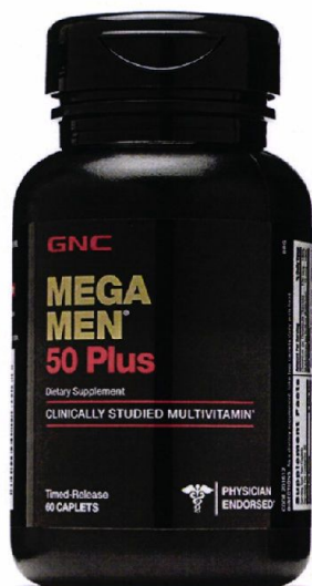
Figure 3. Unregistered GNC MEGA MEN 50 PLUS Dietary Supplement Caplets