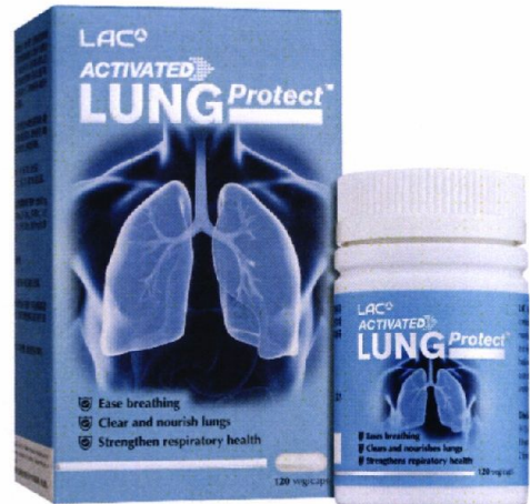
Figure 4. Unregistered LAC ACTIVATED LUNG PROTECT Vegicaps