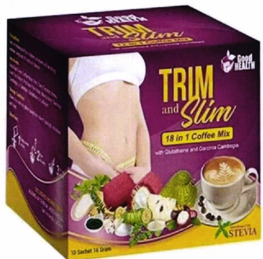
Figure 5. Unregistered TRIM AND SLIM Herbal Coffee Mix

The FDA verified through post-marketing surveillance that the abovementioned food supplements and food product are not authorized and the Certificates of Product Registration have not been issued. Pursuant to the Republic Act No. 9711, otherwise known as the “Food and Drug Administration Act of 2009”, the manufacture, importation, exportation, sale, offering for sale, distribution, transfer, non-consumer use, promotion, advertising or sponsorship of health products without the proper authorization is prohibited.