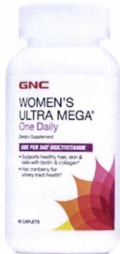
Figure 2. Unregistered GNC WOMEN'S ULTRA MEGA ONE DAILY Dietary Supplement Caplets