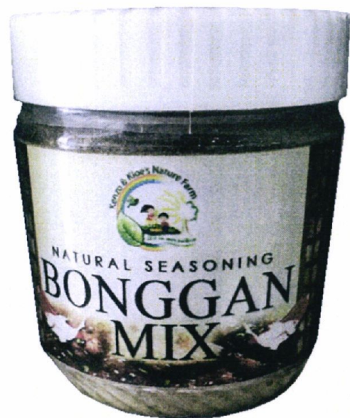
Figure 5. Unregistered KENZO & KLOE'S NATURE FARM Natural Seasoning Bonggan Mix

The FDA verified through post-marketing surveillance that the abovementioned food supplements and food product are not authorized and the Certificates of Product Registration have not been issued. Pursuant to the Republic Act No. 9711, otherwise known as the “Food and Drug Administration Act of 2009”, the manufacture, importation, exportation, sale, offering for sale, distribution, transfer, non-consumer use, promotion, advertising or sponsorship of health products without the proper authorization is prohibited.