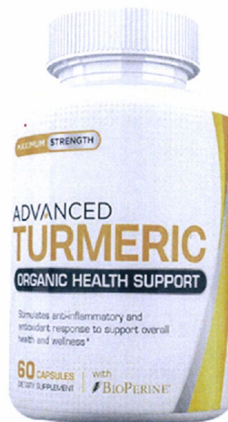
Figure 1. Unregistered MAXIMUM STRENGTH Advanced Turmeric Organic Health Support Dietary Supplement Capsule

The Food and Drug Administration (FDA) warns the public from purchasing and consuming the following unregistered food supplements and food product: