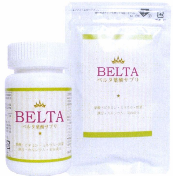
Figure 4. Unregistered BELTA Folic Acid Supplement