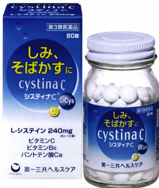
Figure 3. Unregistered CYSTINA C Food Supplement Tablets