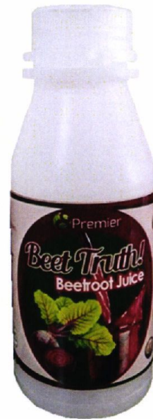
Figure 5. Unregistered PREMIER BEET TRUTH! Beetroot Juice

The FDA verified through post-marketing surveillance that the abovementioned food supplements and food product are not authorized and the Certificates of Product Registration have not been issued. Pursuant to the Republic Act No. 9711, otherwise known as the “Food and Drug Administration Act of 2009”, the manufacture, importation, exportation, sale, offering for sale, distribution, transfer, non-consumer use, promotion, advertising or sponsorship of health products without the proper authorization is prohibited.