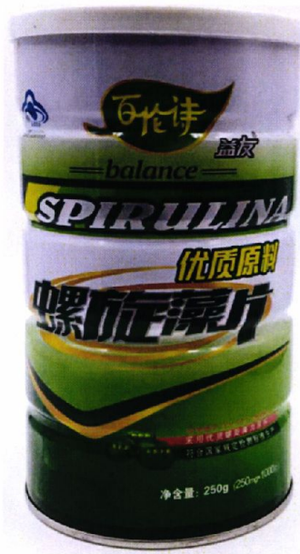
Figure 2. Unregistered BALANCE Spirulina Tablets