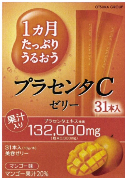
Figure 3. Unregistered OTSUKA Placenta C Jelly