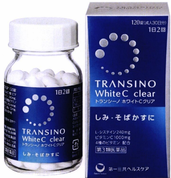
Figure 4. Unregistered TRANSINO White C Clear Tablets