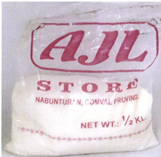
Figure 2. Unregistered AJL STORE Sugar