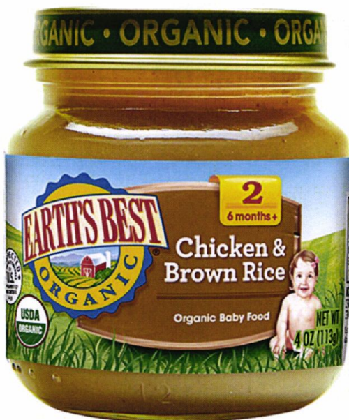
Figure 3. Unregistered EARTH'S BEST ORGANIC Chicken & Brown Rice Organic Baby Food