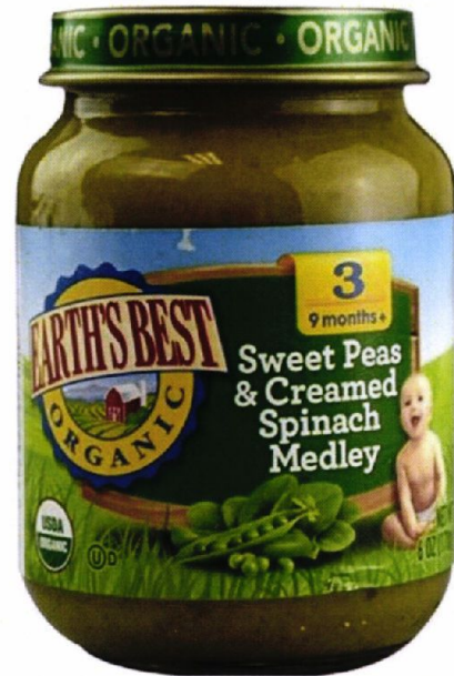
Figure 4. Unregistered EARTH'S BEST Organic Sweet Peas & Creamed Spinach Medley Organic Baby Food