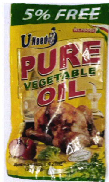
Figure 5. Unregistered W.L. FOODS U NEED Pure Vegetable Oil

The FDA verified through post-marketing surveillance that the abovementioned food products are not authorized and the Certificates of Product Registration have not been issued. Pursuant to the Republic Act No. 9711, otherwise known as the "Food and Drug Administration Act of 2009", the manufacture, importation, exportation, sale, offering for sale, distribution, transfer, non-consumer use, promotion, advertising or sponsorship of health products without the proper authorization is prohibited.