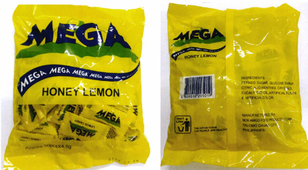
Figure 1. Unregistered MEGA Honey Lemon Candy

The Food and Drug Administration (FDA) warns the public from purchasing and consuming the following unregistered food products: