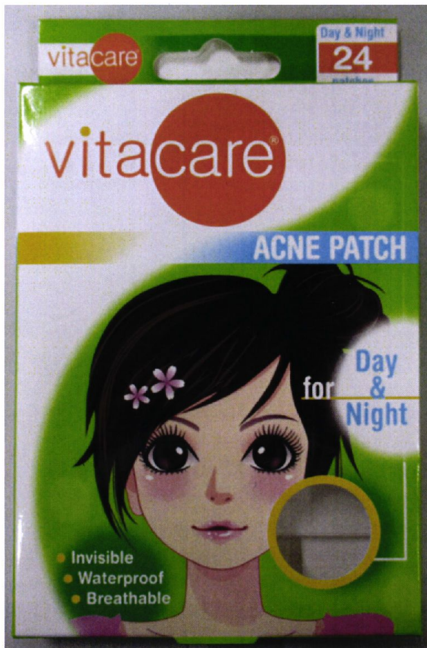
Figure 1. Front label of the unregistered "Vitacare Acne Patch for Day & Night"

The Food and Drug Administration (FDA) warns the general public against the purchase and use of the unregistered medical device: