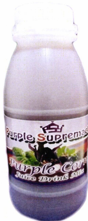
Figure 1. Unregistered PURPLE SUPREMACY Purple Corn Juice Drink

The Food and Drug Administration (FDA) advises the public from purchasing and consuming the following unregistered food products: