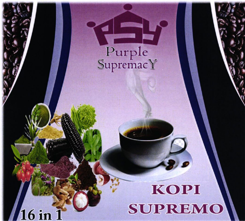
Figure 2. Unregistered PURPLE SUPREMACY Kopi Supremo