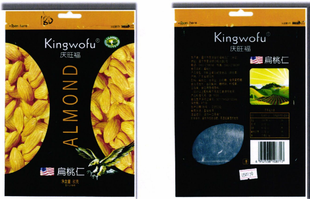
Figure 4. Unregistered KINGWOFU CLASSIC NUTS Almond