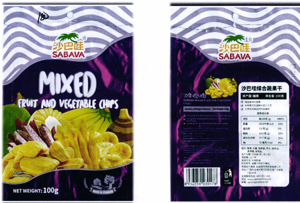
Figure 5. Unregistered SABAVA Mixed Fruit and Vegetable Chips

The FDA verified through post-marketing surveillance that the abovementioned food products are not authorized and the Certificates of Product Registration (CPR) have not been issued. Pursuant to the Republic Act No. 9711, otherwise known as the “Food and Drug