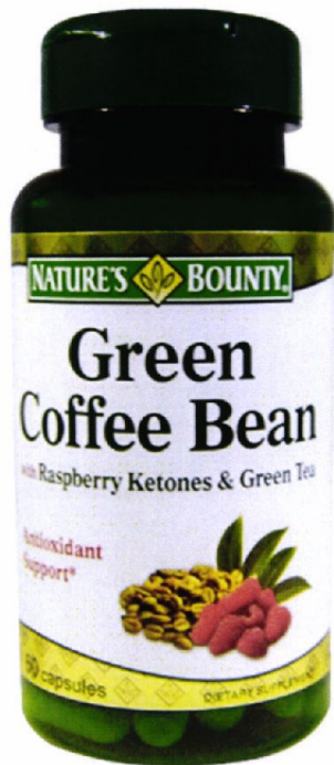
Figure 2. Unregistered NATURE'S BOUNTY Green Coffee Bean with Raspberry Ketones & Green Tea Antioxidant Support Dietary Support