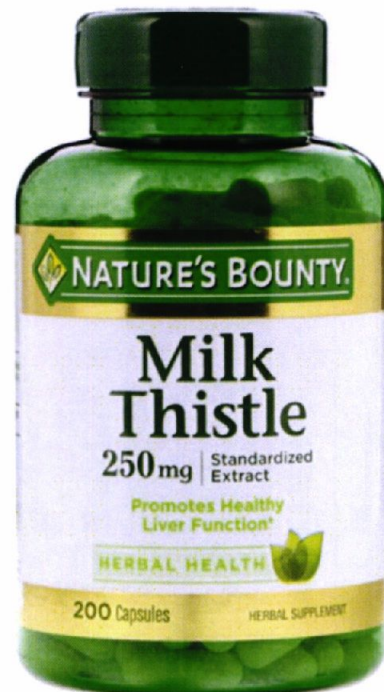
Figure 3. Unregistered NATURE'S BOUNTY Milk Thistle Herbal Supplement