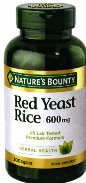
Figure 1. Unregistered NATURE'S BOUNTY NATURE'S BOUNTY Red Yeast Rice Herbal Supplement

The Food and Drug Administration (FDA) warns the public from purchasing and consumption of the following unregistered food supplements: