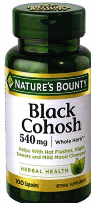
Figure 5. Unregistered NATURE'S BOUNTY Black Cohosh Herbal Supplement