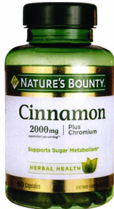
Figure 3. Unregistered NATURE'S BOUNTY Cinnamon plus Chromium Dietary Supplement