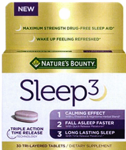
Figure 2. Unregistered NATURE'S BOUNTY Sleep3 Dietary Supplement