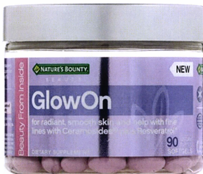
Figure 1. Unregistered NATURE'S BOUNTY Beauty Glow on Dietary Supplement

The Food and Drug Administration (FDA) warns the public from purchasing and consumption of the following unregistered food supplements: