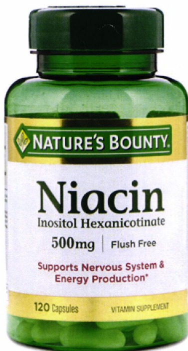
Figure 4. Unregistered NATURE'S BOUNTY Niacin Inositol Hexanicotinate Vitamin Supplement