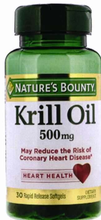
Figure 5. Unregistered NATURE'S BOUNTY Krill Oil Dietary Supplement