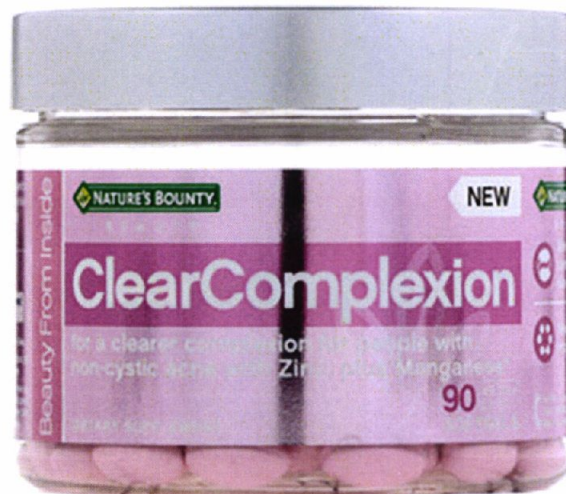
Figure 1. Unregistered NATURE'S BOUNTY Clear Complexion Food Supplement

The Food and Drug Administration (FDA) warns the public from purchasing and consumption of the following unregistered food supplements: