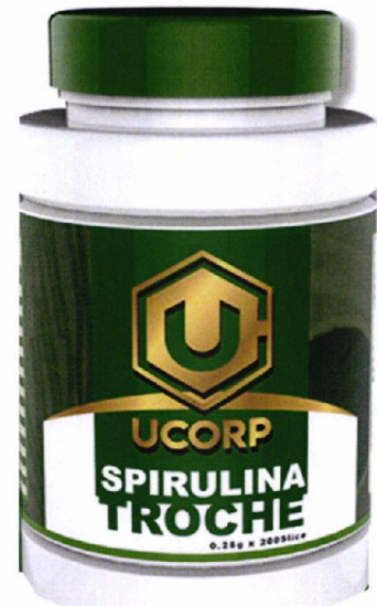
Figure 5. UCORP Spirulina Troche