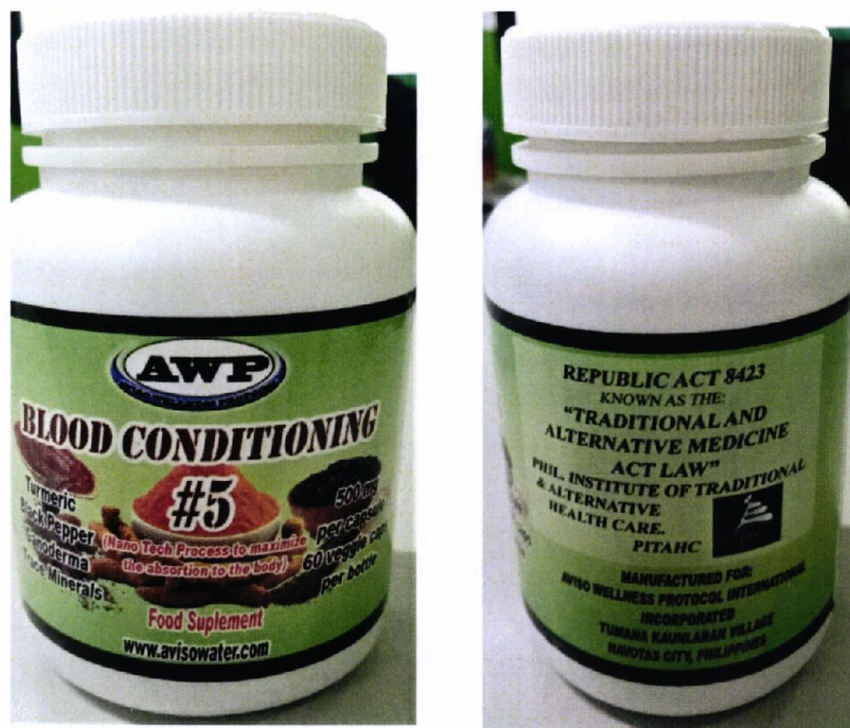
Figure 1. Unregistered AWP BLOOD CONDITIONING #5 Food Supplement

The Food and Drug Administration (FDA) warns the public from purchasing and consuming the following food supplements: