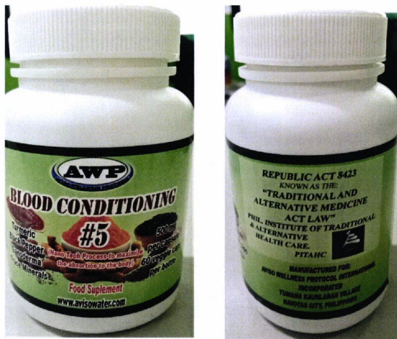
Figure 1. Unregistered AWP BLOOD CONDITIONING #5 Food Supplement

The Food and Drug Administration (FDA) warns the public from purchasing and consuming the following food supplements: