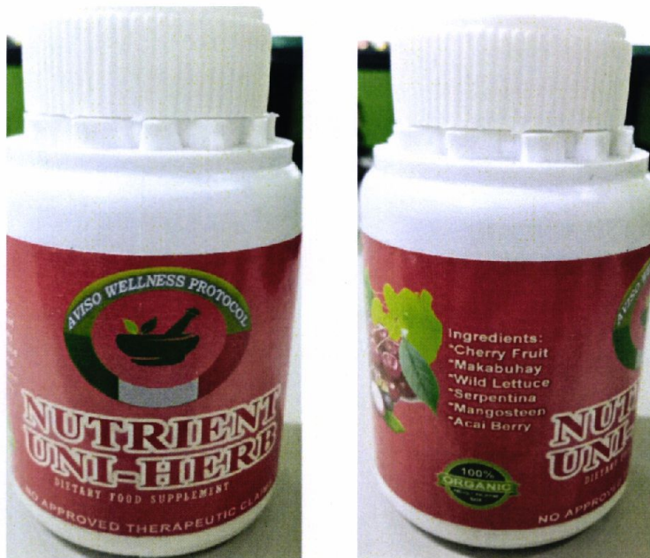
Figure 3. Unregistered AVISO WELLNESS PROTOCOL Nutrient Uni-Herb Dietary Food Supplement