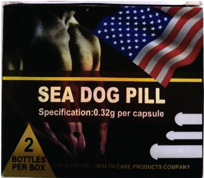
Figure 2. Unregistered SEA DOG PILL, 0.32g/capsule