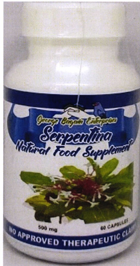
Figure 5. Unregistered GEORGE BARGAIN ENTERPRISES Serpentina Natural Food Supplement