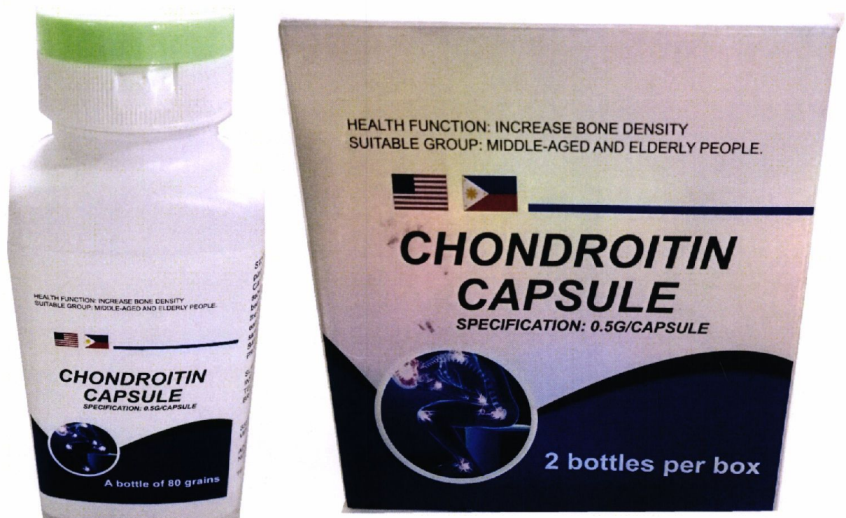
Figure 1. Unregistered CHONDROITIN CAPSULE, 0.5g/capsule

The Food and Drug Administration (FDA) warns the public from purchasing and consuming the following food supplements: