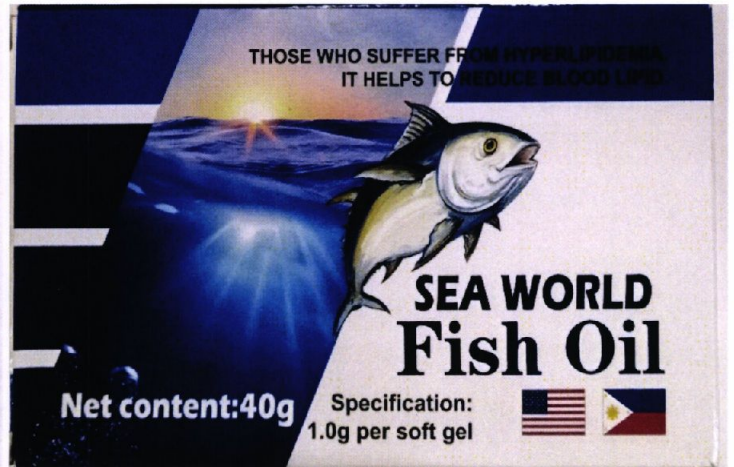
Figure 3. Unregistered SEA WORLD Fish Oil, 1g/softgel, 40g