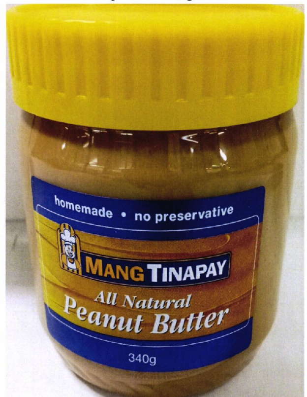
Figure 5. Unregistered MANG TINAPAY All Natural, Peanut Butter, 340g