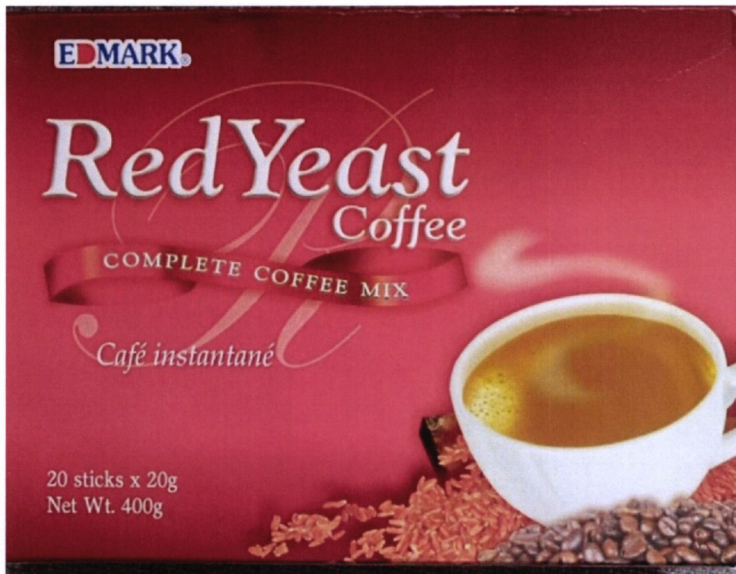
Figure 1. Unregistered EDMARK Red Yeast Coffee, Complete Coffee Mix, Café Instantane 400g

The Food and Drug Administration (FDA) warns the public from purchasing and consuming the following unregistered food products: