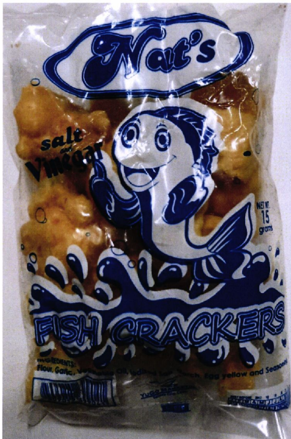
Figure 2. Unregistered NAT'S Salt & Vinegar Fish Cracker