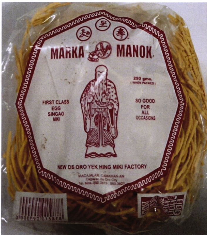
Figure 4. Unregistered MARKA MANOK First Class Egg Singao Miki, 250g