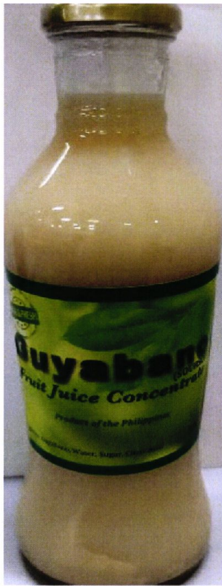
Figure 2. Unregistered Guyabano Fruit Juice Concentrate