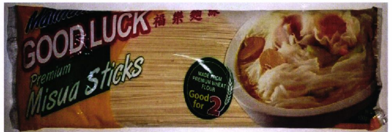
Figure 3. Unregistered Malinamnam GOODLUCK Premium Misua Sticks