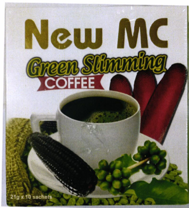
Figure 4. Unregistered NEW MC Green Slimming Coffee