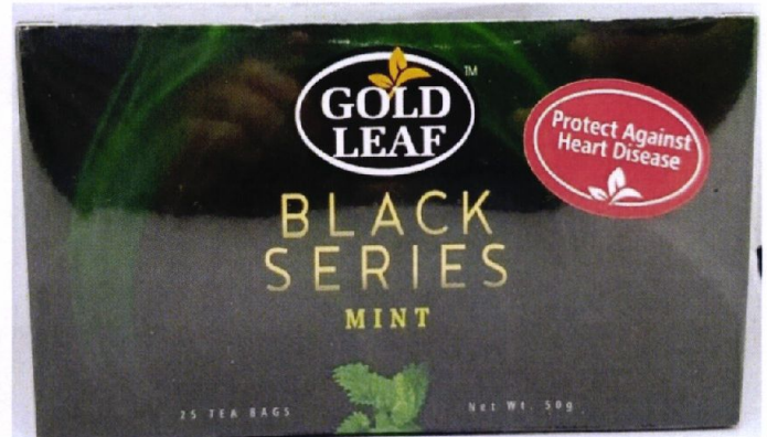
Figure 5. Unregistered GOLD LEAF Black Series Mint