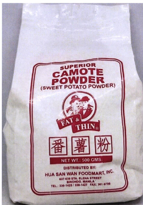
Figure 1. Unregistered FAT & THIN Superior Camote Powder (Sweet Potato Powder)

The Food and Drug Administration (FDA) warns the public from purchasing and consuming the following unregistered food products: