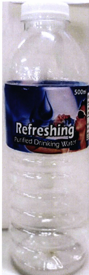
Figure 4. Unregistered REFRESHING Purified Drinking Water, 500ml