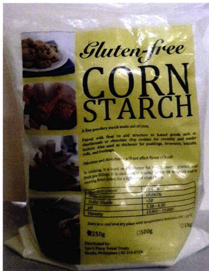
Figure 1. Unregistered GLUTEN-FREE Corn Starch, 250g

The Food and Drug Administration (FDA) warns the public from purchasing and consuming the following unregistered food products: