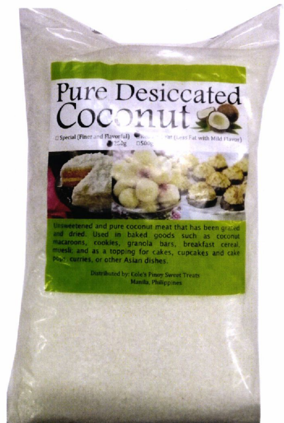
Figure 3. Unregistered PURE DESSICATED Coconut, 250g