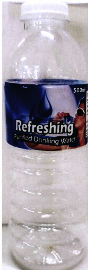
Figure 4. Unregistered REFRESHING Purified Drinking Water, 500ml