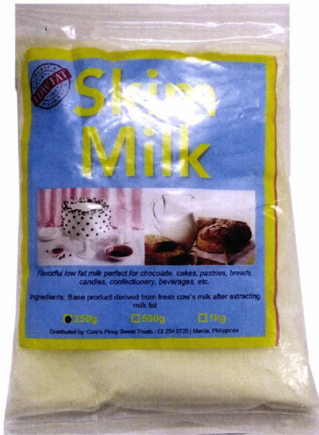
Figure 2. Unregistered LOW FAT SKIM MILK, 250g