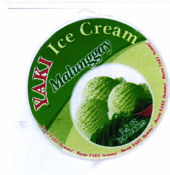
Figure 2. Unregistered YAKI Ice Cream Malunggay