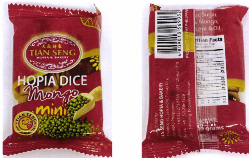
Figure 3. TIAN SENG HOPIA & BAKERY Hopia Dice Mongo Mini