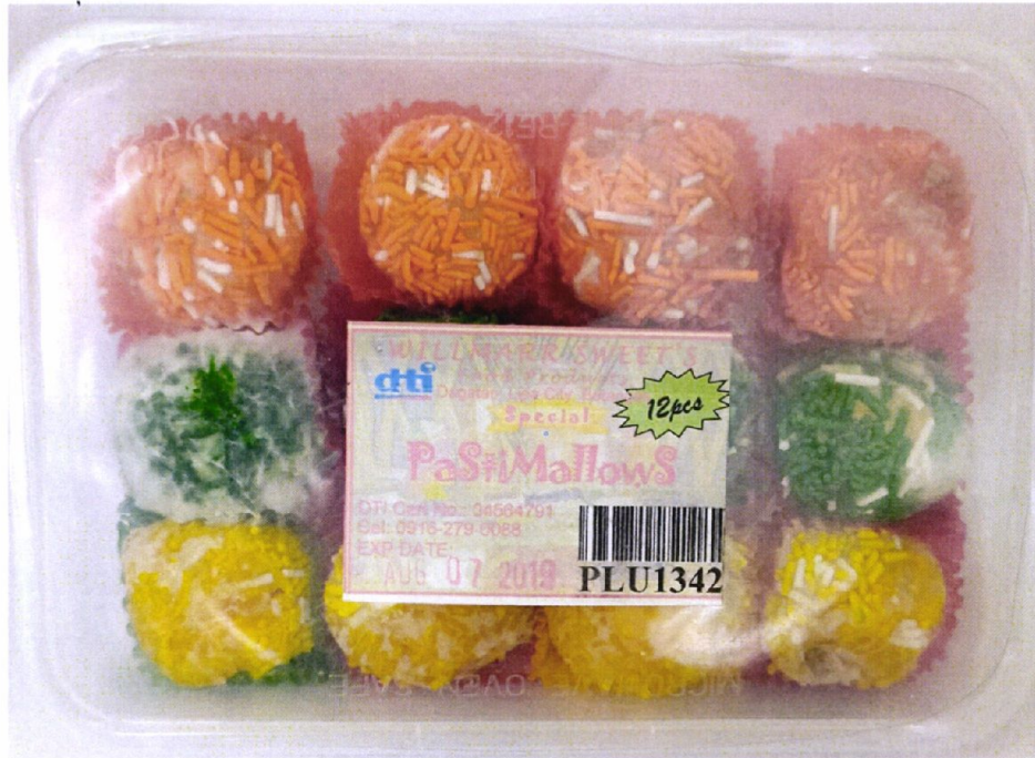
Figure 4. Unregistered WILLMARR SWEET'S FOOD PRODUCTS Special Pastimallows