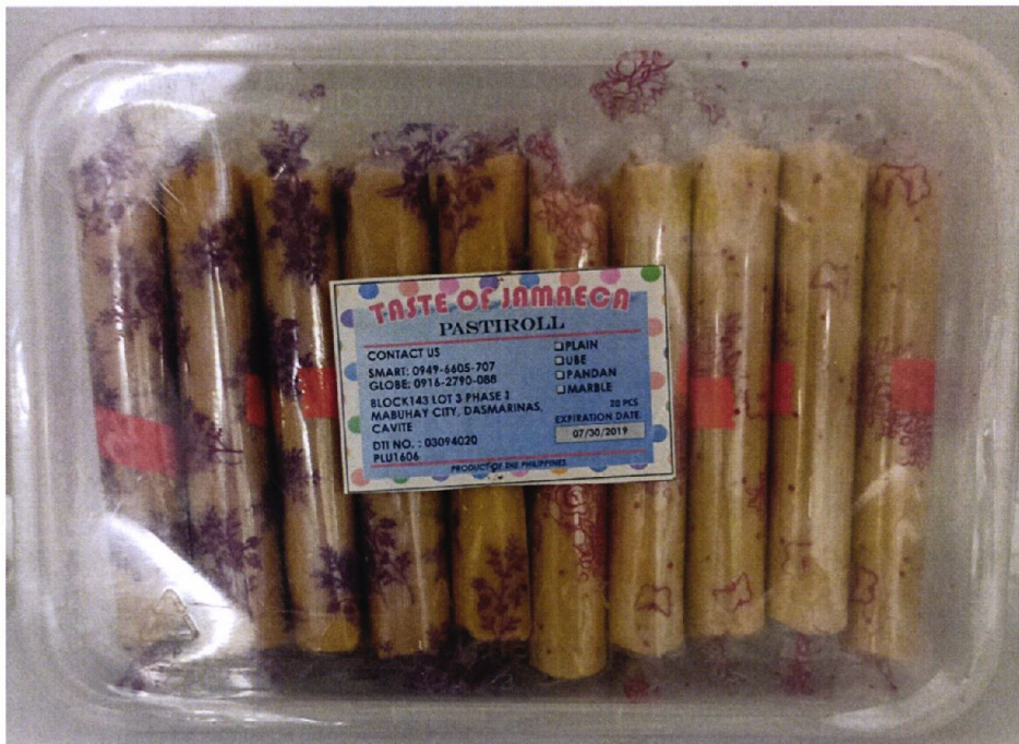
Figure 5. Unregistered TASTE OF JAMAECA Pastiroll

The FDA verified through post-marketing surveillance that the abovementioned food products are not authorized and the Certificates of Product Registration (CPR) have not been issued. Pursuant to the Republic Act No. 9711, otherwise known as the “Food and Drug Administration Act of 2009”, the manufacture, importation, exportation, sale, offering for sale, distribution, transfer, non-consumer use, promotion, advertising or sponsorship of health products without the proper authorization is prohibited.