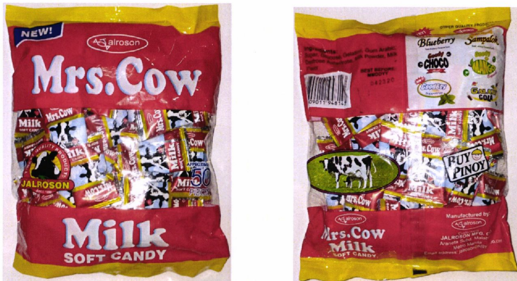
Figure 3. Unregistered JALROSON MRS. COW Milk Soft Candy