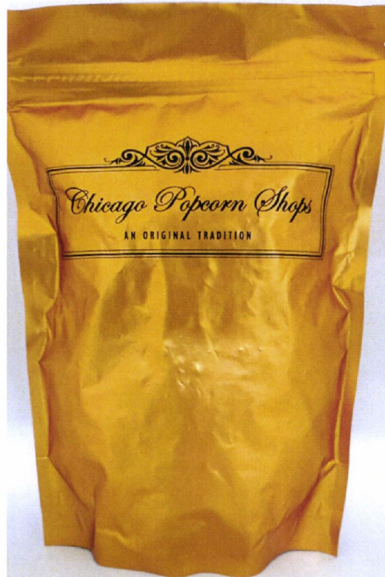
Figure 1. Unregistered CHICAGO POPCORN SHOPS Almond Cashew

The Food and Drug Administration (FDA) advises the public from purchasing and consuming the following unregistered food products: