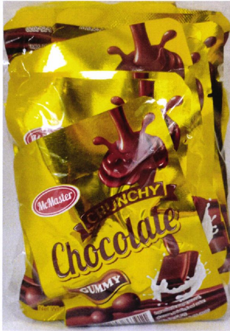
Figure 4. Unregistered MCMASTER Crunchy Chocolate Gummy