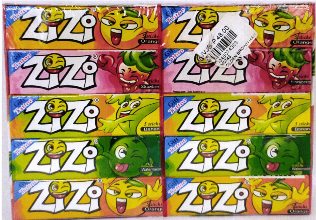
Figure 1. Unregistered ZIZI Bubblegum Assorted Flavour

The Food and Drug Administration (FDA) advises the public from purchasing and consuming the following unregistered food products: