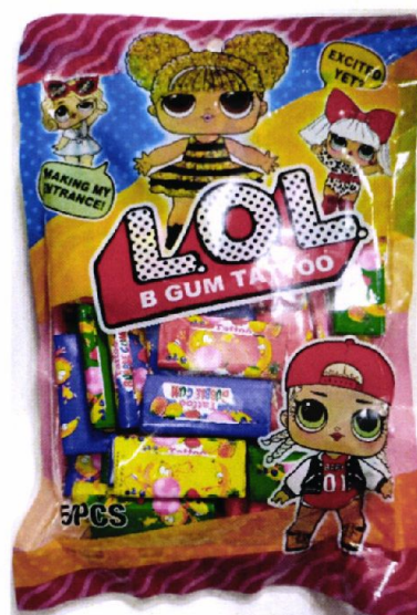
Figure 3. Unregistered L.O.L. B GUM TATTOO Bubble Gum