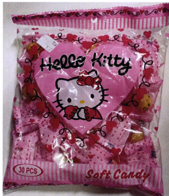
Figure 5. Unregistered Hello Kitty Soft Candy

The FDA verified through post-marketing surveillance that the abovementioned food products are not authorized and the Certificates of Product Registration (CPR) have not been issued. Pursuant to the Republic Act No. 9711, otherwise known as the "Food and Drug Administration Act of 2009", the manufacture, importation, exportation, sale, offering for sale, distribution, transfer, non-consumer use, promotion, advertising or sponsorship of health products without the proper authorization is prohibited.