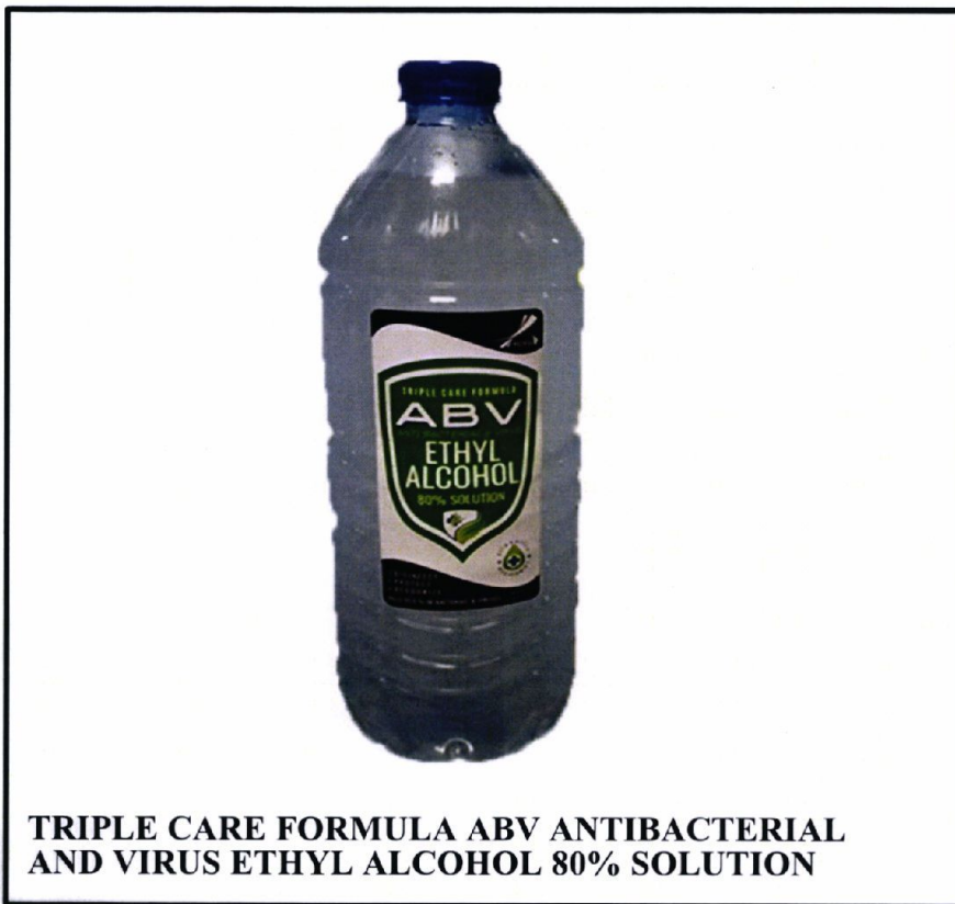
TRIPLE CARE FORMULA ABV ANTIBACTERIAL AND VIRUS ETHYL ALCOHOL 80% SOLUTION