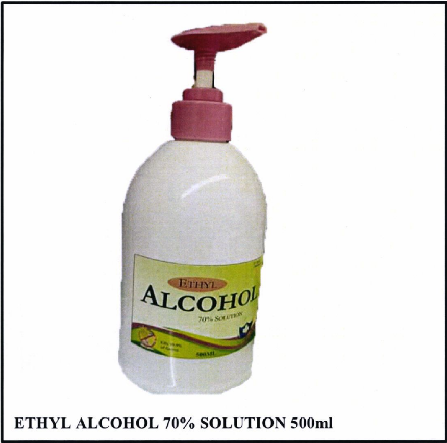
ETHYL ALCOHOL 70% SOLUTION 500ml