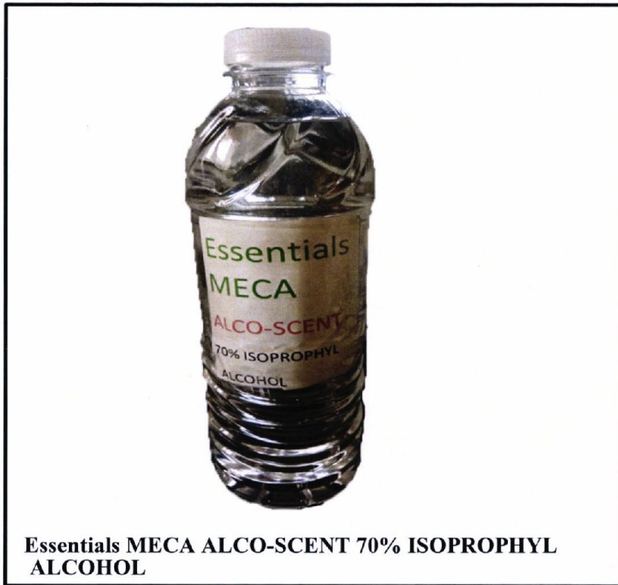
Essentials MECA ALCO-SCENT 70% ISOPROPHYL ALCOHOL