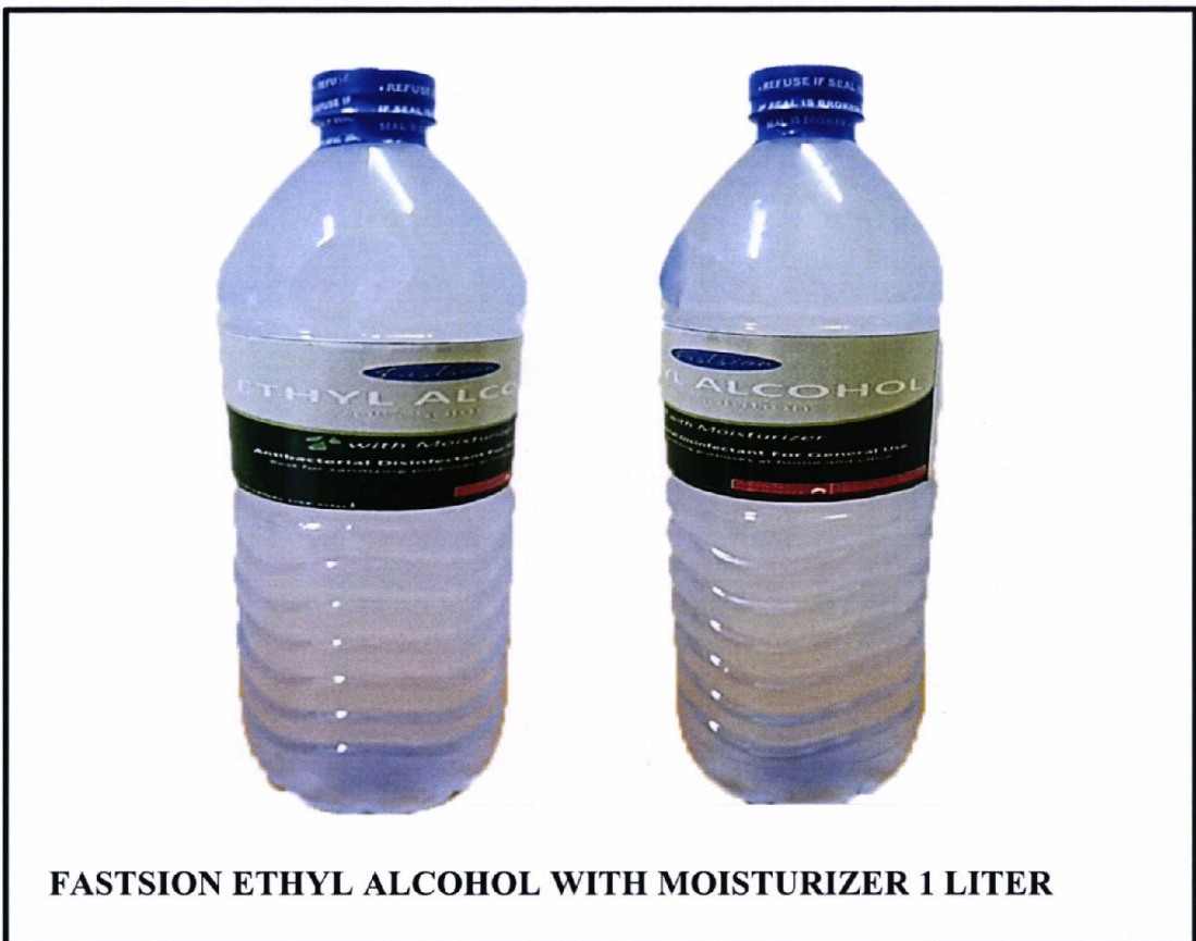
Larawan 3. Hindi rehistradong gamot