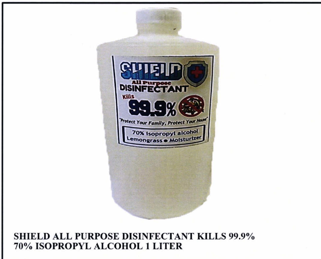
Larawan 1. Hindi rehistradong gamot

Pinapayuhan ng Food and Drug Administration (FDA) ang publiko laban sa pagbili at paggamit ng hindi rehistradong mga gamot na: