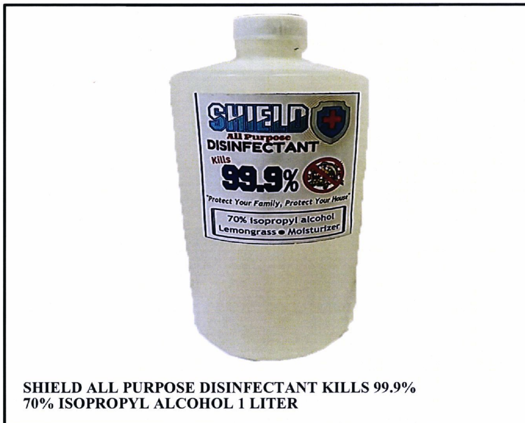
Figure 1. Unregistered drug product

The Food and Drug Administration (FDA) advises the public against the purchase and use of the following unregistered drug products: