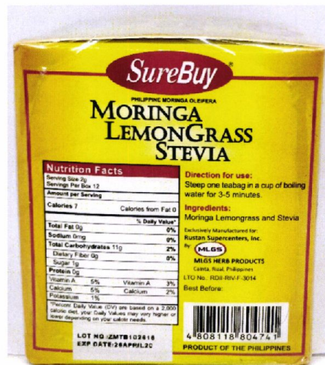
Figure 2. Unregistered SUREBUY Moringa Lemongrass Stevia Herbal Tea