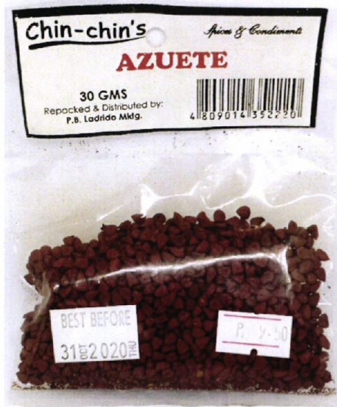
Figure 5. Unregistered CHIN-CHIN'S AZUETE

The FDA verified through post-marketing surveillance that the abovementioned food products are not authorized and the Certificates of Product Registration (CPR) have not been issued. Pursuant to the Republic Act No. 9711, otherwise known as the “Food and Drug Administration Act of 2009”, the manufacture, importation, exportation, sale, offering for sale, distribution, transfer, non-consumer use, promotion, advertising or sponsorship of health products without the proper authorization is prohibited.