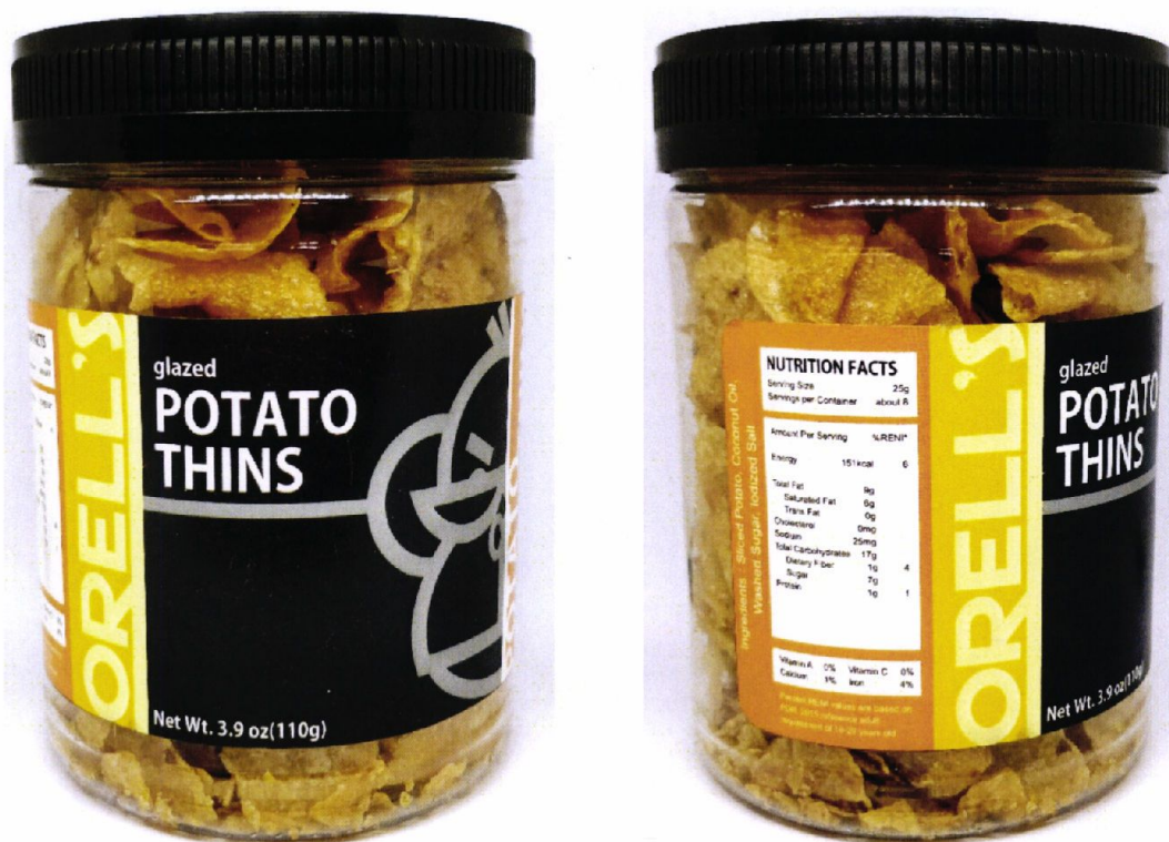
Figure 4. Unregistered ORELL'S Glazed Potato Thins