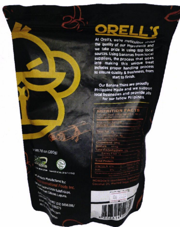
Figure 3. Unregistered ORELL'S Banana Thins Cinnamon